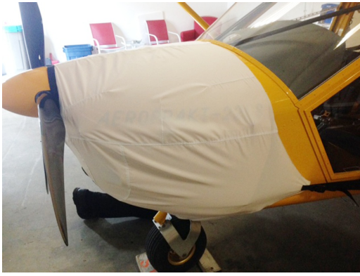
A-22 Engine Cover, test fit