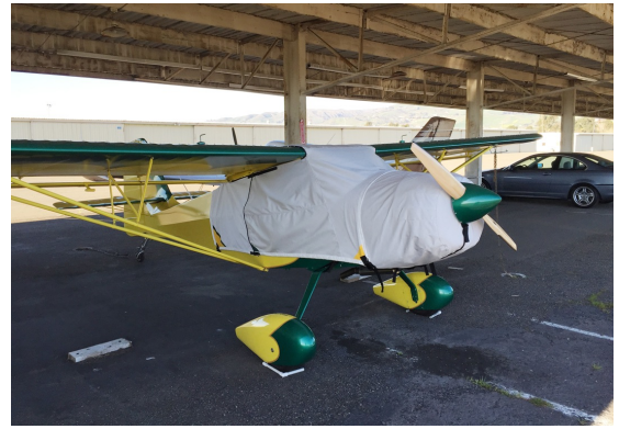
Kitfox Canopy & Engine Covers