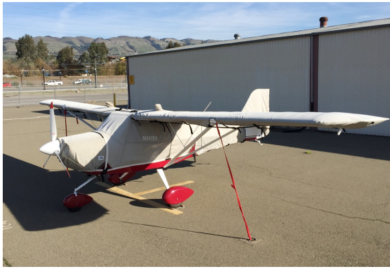
Eurofox Canopy, Engine, Wings and Empennage Covers