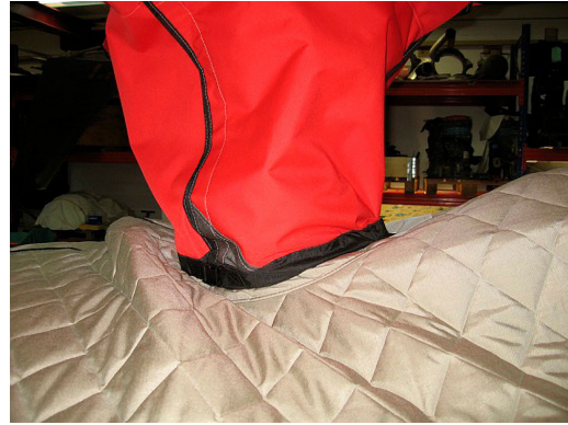
Alouette III Rotor Hub Cover & Engine/Transmission Cover