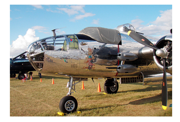
Mitchell B25 Cockpit Cover (Snap-On Type)

Engine Inlet Plugs are custom fit for your Douglas A26 Invader intakes, made with heavy-duty vinyl material, and stuffed with a single block of sculpted urethane foam. Each plug has a zipper that allows the foam to be removed and dried if necessary. Engine plugs have warning flags that are visible from the cockpit or 'remove before flight' streamers sewn onto the face of the plugs. Most plugs are imprinted with the aircraft registration number in black for an extra charge. Storage bag NOT included. Engine plugs may be inserted after flight when the engine is still warm. Engine Inlet Plugs are commonly referred to as Cowl Plugs, Intake Plugs, Cowl Blocks, Engine Blocks, and Engine Bungs.