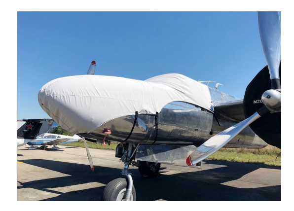
Douglas A26 Invader Cockpit/Nose Cover