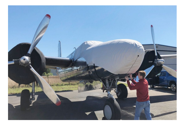
Douglas A26 Invader Cockpit/Nose Cover

the hottest of days. It is water, ice and snow repellent, yet breathable to allow moisture to escape from between the cover and the aircraft surface.