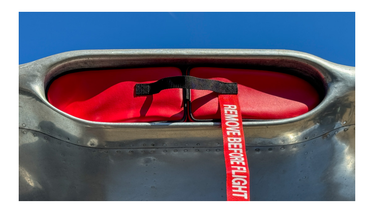
Douglas A26 Invader Oil Cooler Inlet Plugs