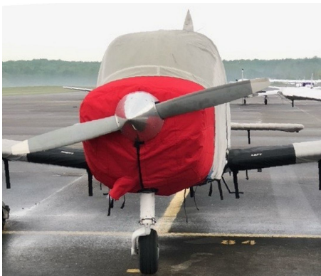
Beech Sierra Insulated Engine Cover