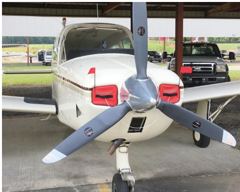
Beech Sierra Engine Inlet Plugs