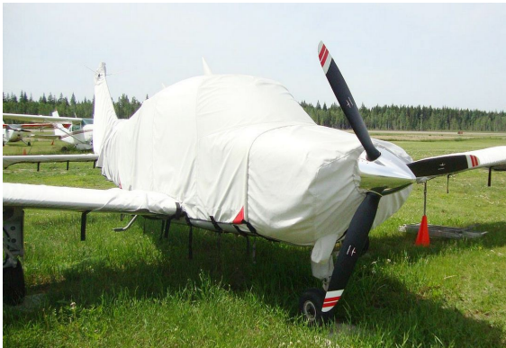
Beech Musketeer Tailcone Cover (Fully Enclosed)