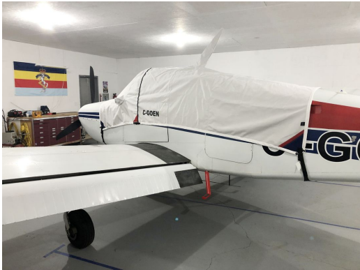
Beech Sierra B24R Canopy Cover

This cover type is made from Silver Acrylic Sunbrella canvas and is 100% lined with a soft and smooth microfiber. Bruce's Custom Covers developed this material combination especially for aircraft protection. The outer material is medium weight and treated for water resistance, UV resistance and anti-static buildup. The inner lining is a very soft and smooth microfiber to prevent scratching. The material is very reflective, and tests show that the cabin interior temperature can be reduced to near-ambient temperature on the hottest of days. It is water, ice and snow repellent, yet breathable to allow moisture to escape from between the cover and the aircraft surface.