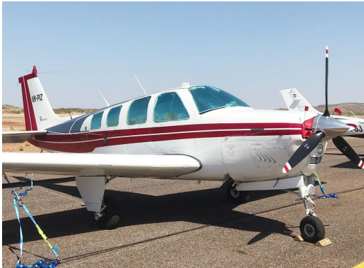
Beech A-36 Bonanza Cabin HeatShields

Windshield Heatshields are interior sunshades for an aircraft's front windshield. The product is a unique composite of closed-cell foam with a silver mylar finish. The semi-rigid design is stiff enough to stand along the inside of the windshield using sun visors or window framing. It folds up flat and easily stores in the included storage sleeve. Some designs may require velcro and suction cups or split right and left sides. A Heatshield is an excellent short-term remedy for cockpit overheating. An external fabric cover is far more effective and practical for long-term protection.