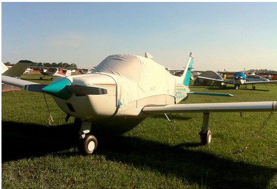
Beech C23 Sundowner Canopy Cover