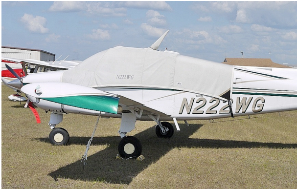
Beech Musketeer Canopy Cover