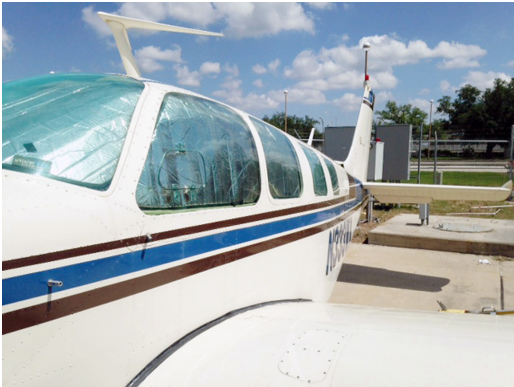
Beech Bonanza HeatShields