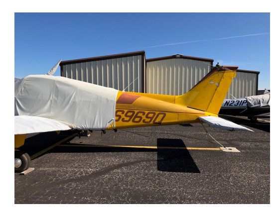
Beech Musketeer Extended Canopy Cover, Horizontal Stabilizer Covers