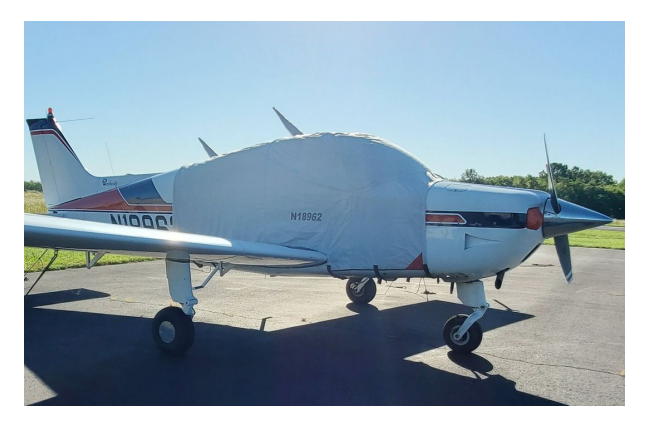
Beech C23 Sundowner Extended Canopy Cover

This cover type is made from Silver Acrylic Sunbrella canvas and is 100% lined with a soft and smooth microfiber. Bruce's Custom Covers developed this material combination especially for aircraft protection. The outer material is medium weight and treated for water resistance, UV resistance and anti-static buildup. The inner lining is a very soft and smooth microfiber to prevent scratching. The material is very reflective, and tests show that the cabin interior temperature can be reduced to near-ambient temperature on the hottest of days. It is water, ice and snow repellent, yet breathable to allow moisture to escape from between the cover and the aircraft surface.