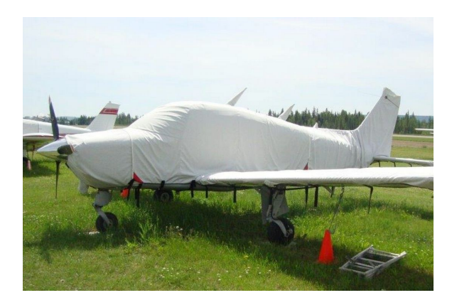
Beech Sierra Engine, Extended Canopy, Empennage, & Wing Covers