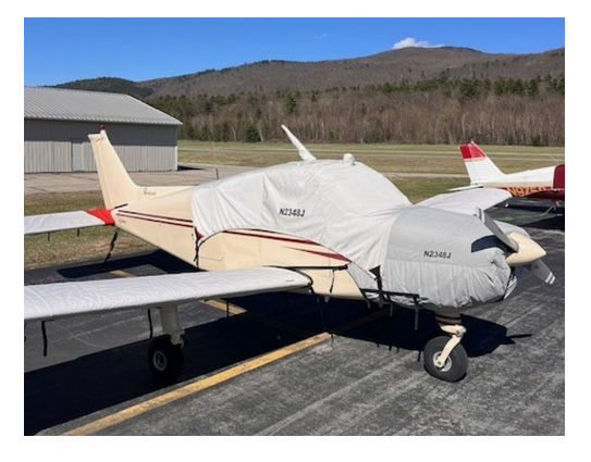
Beech A23 Musketeer Canopy, Insulated Engine, Wing Covers

This cover type is made from Silver Acrylic Sunbrella canvas and is 100% lined with a soft and smooth microfiber. Bruce's Custom Covers developed this material combination especially for aircraft protection. The outer material is medium weight and treated for water resistance, UV resistance and anti-static buildup. The inner lining is a very soft and smooth microfiber to prevent scratching. The material is very reflective, and tests show that the cabin interior temperature can be reduced to near-ambient temperature on the hottest of days. It is water, ice and snow repellent, yet breathable to allow moisture to escape from between the cover and the aircraft surface.