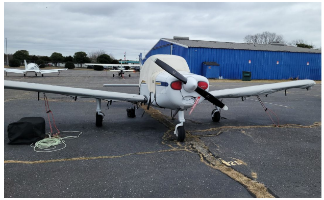
Beech Musketeer A23 Wing Covers

WINTER USE MATERIAL - Made with Solution-Dyed Polyester fabric, this option is intended for seasonal use to aid in deicing, rain mitigation, or for occasional travel. The material is lighter and more compact, but more susceptible to UV damage and may have a shorter useful life if used continuously outside than the all-year use material.