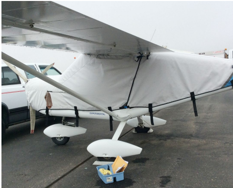
Aeroprakt A-22 Valor Capetown, Foxbat Canopy/Engine Cover