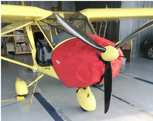
Aeroprakt A-22 Valor Insulated Engine Cover