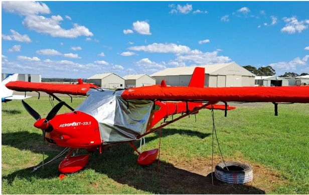
Aeroprakt A22 Wing & Empennage Covers

WINTER USE MATERIAL - Made with Solution-Dyed Polyester fabric, this option is intended for seasonal use to aid in deicing, rain mitigation, or for occasional travel. The material is lighter and more compact, but more susceptible to UV damage and may have a shorter useful life if used continuously outside than the all-year use material.