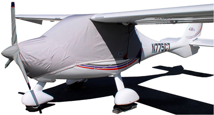
Flight Design CT Canopy/Engine Cover

Travel Covers are made with Silver Solution-Dyed Polyester fabric and only lined over the windshield to save weight. The material is lightweight and more compact for easy stowage in the aircraft. The polyester material is water resistant, but only intended for occasional use outside. We also have an ultra lightweight material available for fitted hangar dust covers. For daily outdoor use, the non-travel Sunbrella Cover is the best choice.