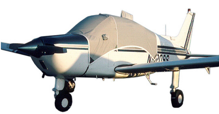
Beech Sport Canopy Cover