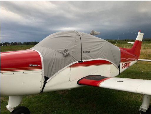
Beech Sundowner Travel Canopy Cover

Travel Covers are made with Silver Solution-Dyed Polyester fabric and only lined over the windshield to save weight. The material is lightweight and more compact for easy stowage in the aircraft. The polyester material is water resistant, but only intended for occasional use outside. We also have an ultra lightweight material available for fitted hangar dust covers. For daily outdoor use, the non-travel Sunbrella Cover is the best choice.