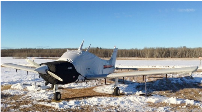
Beech Sport Insulated Engine Cover & Winter Cover Set