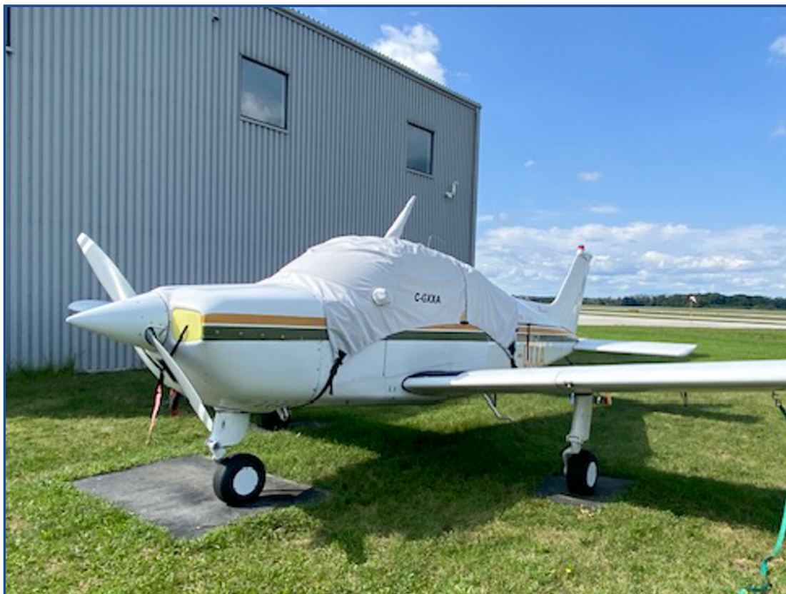
Beech Sport A19 Canopy Cover