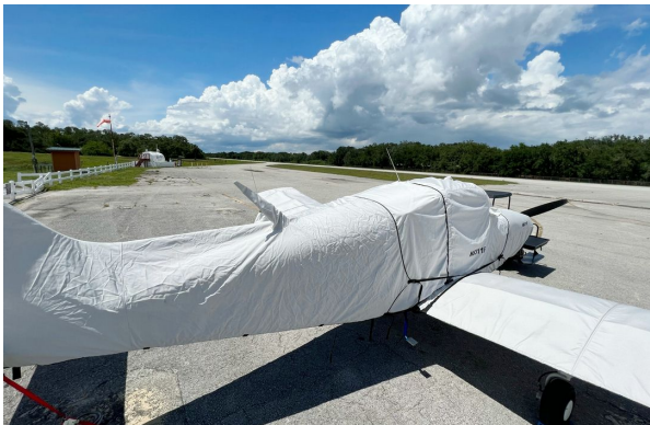
Beech Musketeer A23 Cover Set

This cover type is made from Silver Acrylic Sunbrella canvas and is 100% lined with a soft and smooth microfiber. Bruce's Custom Covers developed this material combination especially for aircraft protection. The outer material is medium weight and treated for water resistance, UV resistance and anti-static buildup. The inner lining is a very soft and smooth microfiber to prevent scratching. The material is very reflective, and tests show that the cabin interior temperature can be reduced to near-ambient temperature on the hottest of days. It is water, ice and snow repellent, yet breathable to allow moisture to escape from between the cover and the aircraft surface.