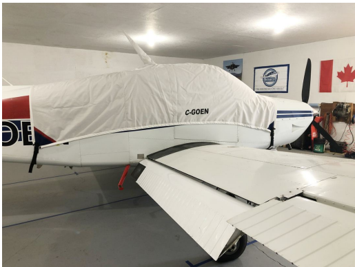
Beech Sierra B24R Canopy Cover