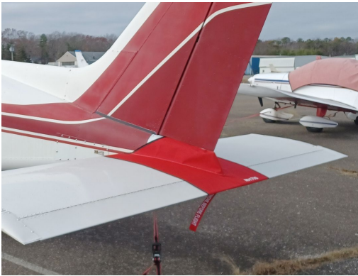
Beech C23 Sundowner Tailcone Cover, fully enclosed