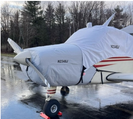
Beech Musketeer Insulated Engine Cover

This cover type is made from Silver Acrylic Sunbrella canvas and is 100% lined with a soft and smooth microfiber. Bruce's Custom Covers developed this material combination especially for aircraft protection. The outer material is medium weight and treated for water resistance, UV resistance and anti-static buildup. The inner lining is a very soft and smooth microfiber to prevent scratching. The material is very reflective, and tests show that the cabin interior temperature can be reduced to near-ambient temperature on the hottest of days. It is water, ice and snow repellent, yet breathable to allow moisture to escape from between the cover and the aircraft surface.