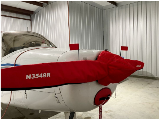
Beech A23 Musketeer Insulated Prop Cover, Engine Plugs