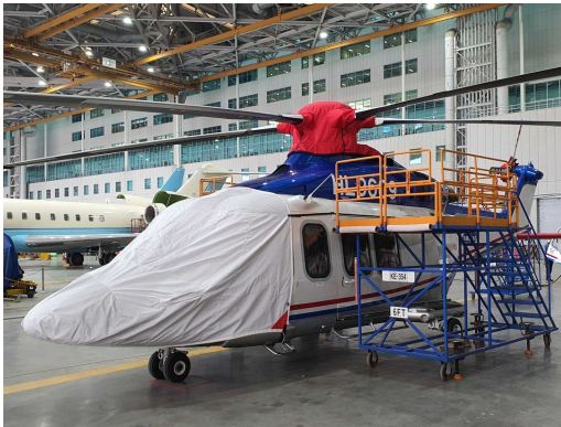
Agusta AW139 Cockpit/Nose, Rotor Mast Cover