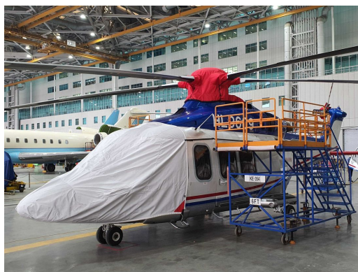
Agusta AW139 Cockpit/Nose, Rotor Mast Cover

This cover type is made from Silver Acrylic Sunbrella canvas and is 100% lined with a soft and smooth microfiber. Bruce's Custom Covers developed this material combination especially for aircraft protection. The outer material is medium weight and treated for water resistance, UV resistance and anti-static buildup. The inner lining is a very soft and smooth microfiber to prevent scratching. The material is very reflective, and tests show that the cabin interior temperature can be reduced to near-ambient temperature on the hottest of days. It is water, ice and snow repellent, yet breathable to allow moisture to escape from between the cover and the aircraft surface.