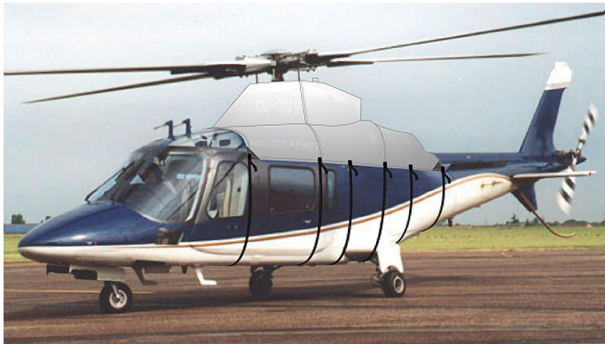
Agusta Power Engine Cover (illustration)

WINTER USE MATERIAL - Made with Solution-Dyed Polyester fabric, this option is intended for seasonal use to aid in deicing, rain mitigation, or for occasional travel. The material is lighter and more compact, but more susceptible to UV damage and may have a shorter useful life if used continuously outside than the all-year use material.