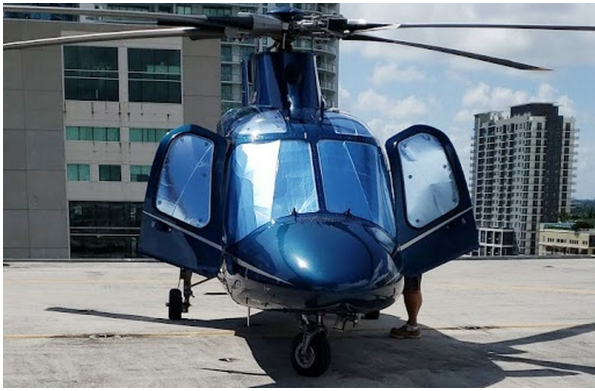
Agusta AW109 Power, A109E Heatshield Set