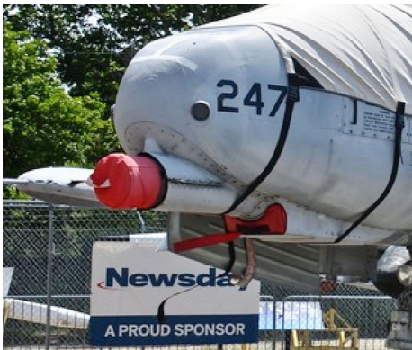
Fairchild A10 Thunderbolt Nose Gun Cover, Gun Scoop Inlet Plug

The Engine Inlet Plugs are custom fit for your Fairchild A10 Thunderbolt intakes, made with heavy-duty vinyl material, and stuffed with a single block of sculpted urethane foam. Each plug has a zipper that allows the foam to be removed and dried if necessary. Engine plugs have 'remove before flight' streamers sewn onto the face of the plugs. Most plugs are imprinted with the aircraft registration number in black for an extra charge. Storage bag NOT included. Engine plugs may be inserted after flight when the engine is still warm. Engine Inlet Plugs are commonly referred to as Cowl Plugs, Intake Plugs, Cowl Blocks, Engine Blocks, and Engine Bungs.