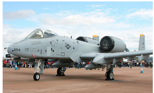
A-10 Engine Covers with Custom Artwork