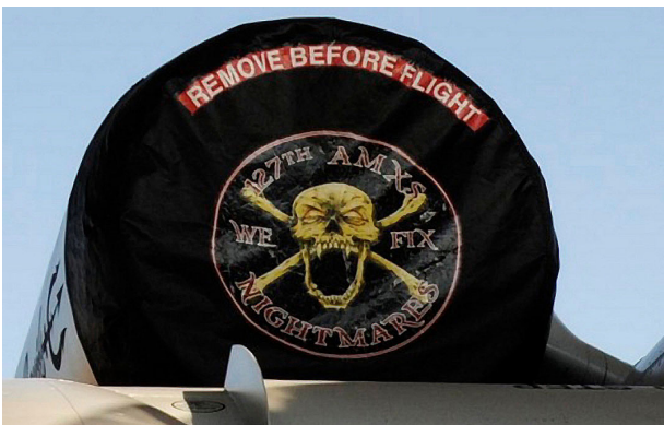
A-10 Engine Covers with Custom Artwork

ALL-YEAR USE MATERIAL - Made with Solution dyed Polyester fabric, the all-year use material is the best option for sun protection and cover longevity. This heavier more durable material is intended for all weather conditions, such as rain and snow or lots of sun.