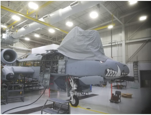
Fairchild A-10 Canopy Cover, open position