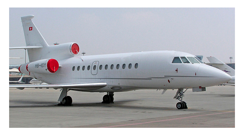
Falcon 900 Engine Covers, hook detail