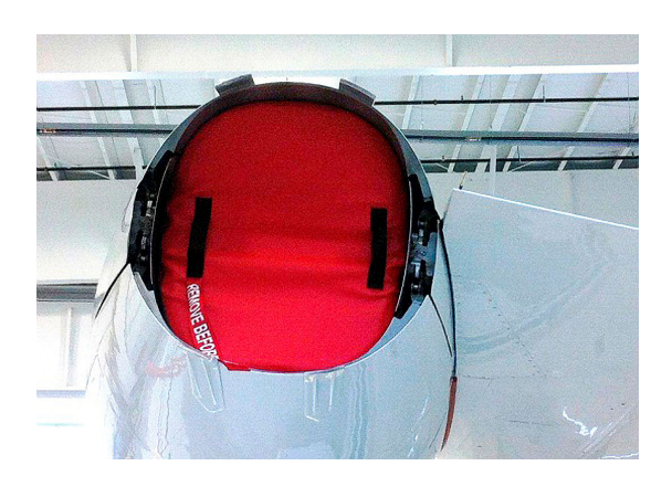
Falcon 2000EX Exhaust Plug