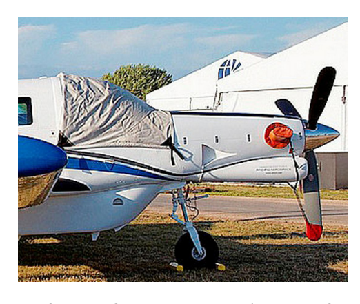
750XL Cockpit Cover & Prop Tie/Exhaust Covers