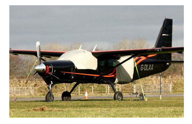
Cessna Caravan Cockpit Cover, Engine Plugs, Jump Door Cover