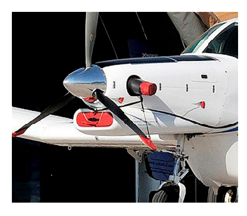
750XL Engine Inlet Plugs & Prop Tie/Exhaust Covers