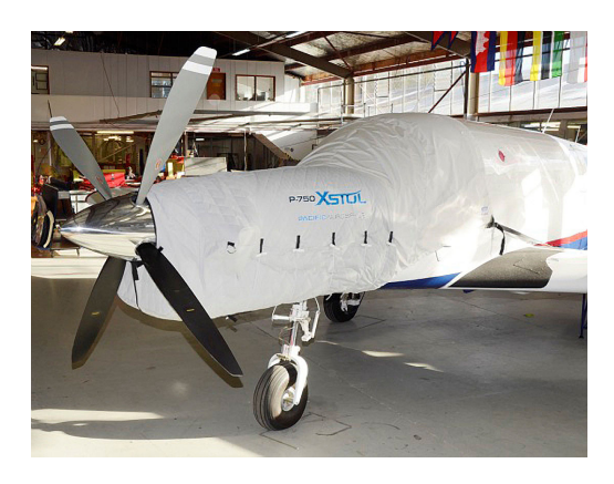
750XL Combination Insulated Engine Cover/Cockpit Cover

The material is very reflective, and tests show that the cabin interior temperature can be reduced to near-ambient temperature on the hottest of days. It is water, ice and snow repellent, yet breathable to allow moisture to escape from between the cover and the aircraft surface.