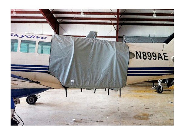
750XL Jump Door Cover