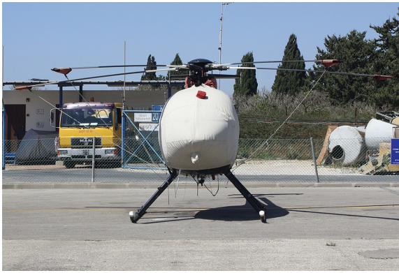
MD-500E Bubble Cover, Blade Tie-Downs