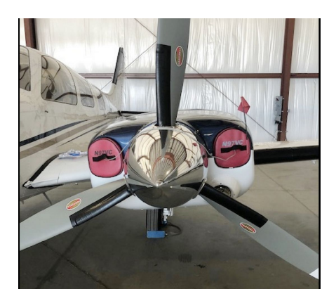
Beech Baron 58P Engine Inlet Plugs

Engine Inlet Plugs are custom fit for your Beech Baron 58TC intakes, made with heavy-duty vinyl material, and stuffed with a single block of sculpted urethane foam. Each plug has a zipper that allows the foam to be removed and dried if necessary. Engine plugs have warning flags that are visible from the cockpit or 'remove before flight' streamers sewn onto the face of the plugs. Most plugs are imprinted with the aircraft registration number in black for an extra charge. Storage bag NOT included. Engine plugs may be inserted after flight when the engine is still warm. Engine Inlet Plugs are commonly referred to as Cowl Plugs, Intake Plugs, Cowl Blocks, Engine Blocks, and Engine Bungs.