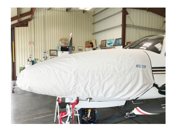
Beech Baron G58 Nose Cover