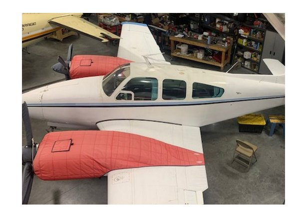
Beech Baron B55 Insulated Engine Covers