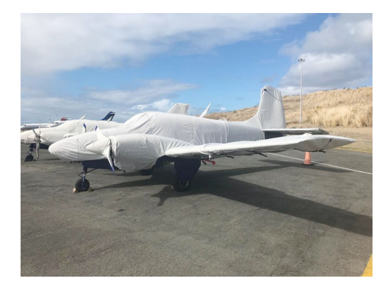
Beech Travel Air Full Cover Set