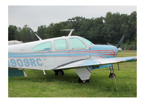
Beech Bonanza/Debonair HeatShield Set