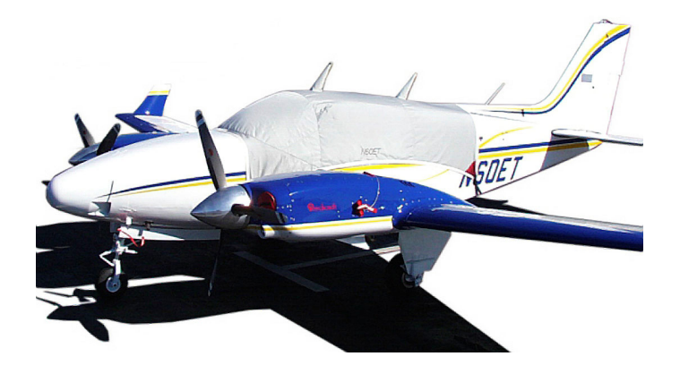
Standard Canopy Cover & Engine Plugs

Travel Covers are made with Silver Solution-Dyed Polyester fabric and only lined over the windshield to save weight. The material is lightweight and more compact for easy stowage in the aircraft. The polyester material is water resistant, but only intended for occasional use outside. We also have an ultra lightweight material available for fitted hangar dust covers. For daily outdoor use, the non-travel Sunbrella Cover is the best choice.