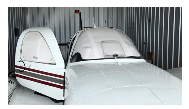
Beech Baron 58P Cockpit Heatshield Set

Heatshields are interior sunshades for an aircraft's windows or canopy glass. The product is a unique composite of closed-cell foam with a silver mylar finish. The semi-rigid design is stiff enough to stand along the inside of the windshield using sun visors or window framing. It folds up flat and easily stores in the included storage sleeve. Some designs may require velcro and suction cups. A Heatshield is an excellent short-term remedy for cockpit overheating.