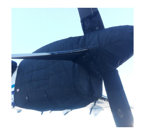
Standard Canopy Cover & Engine Plugs. Extended Canopy Cover & Engine Cover