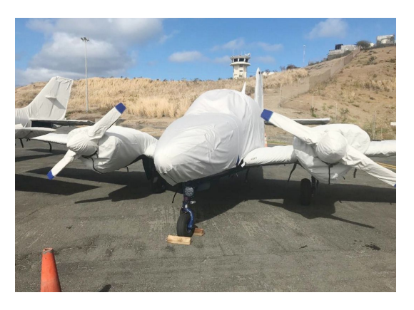
Beech Travel Air Full Cover Set

WINTER USE MATERIAL - Made with Solution-Dyed Polyester fabric, this option is intended for seasonal use to aid in deicing, rain mitigation, or for occasional travel. The material is lighter and more compact, but more susceptible to UV damage and may have a shorter useful life if used continuously outside than the all-year use material.