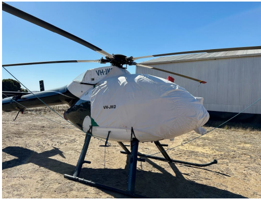
MDD 520 NOTAR Bubble Cover w/Intake Cover Add-On