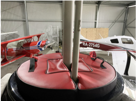
Bell 505 Jet Ranger X Swash Plate Plug