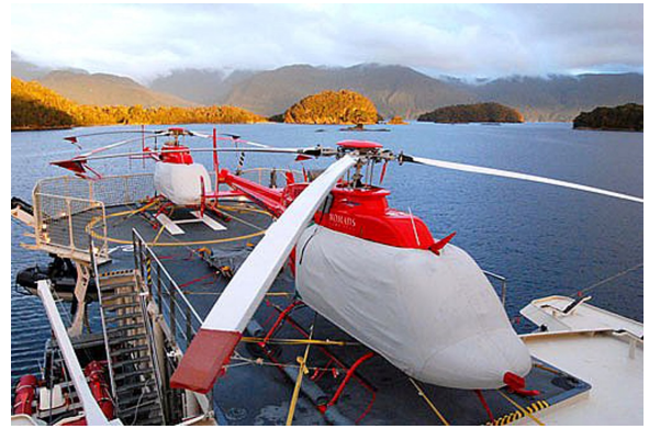
Bell 407 Bubble Cover