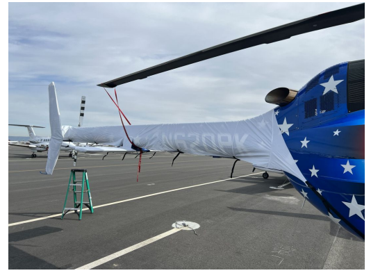
Bell 505 Tailboom & Stabilizer Covers, test fit cover