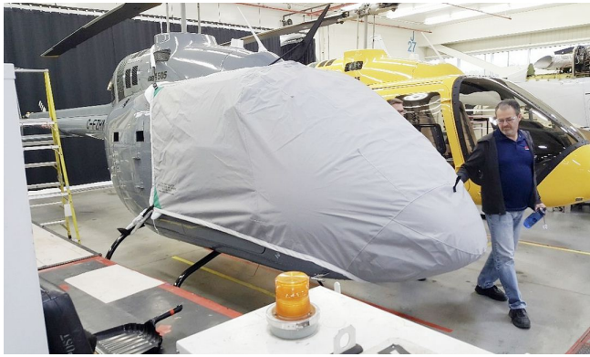
Bell 505 Bubble Cover