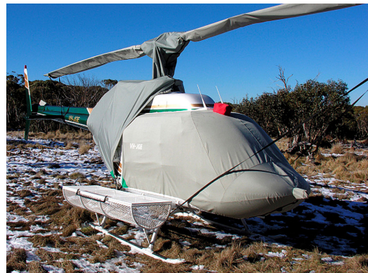
JetRanger Bubble, Engine, Rotor Hub & Blade Covers (& Tie-Downs)