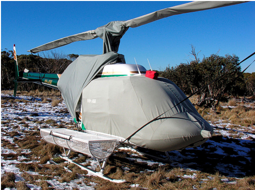
JetRanger Bubble, Engine, Rotor Hub & Blade Covers (& Tie-Downs)

The Engine Inlet Plugs are custom fit for your Bell 505 Jet Ranger X intakes, made with heavy-duty vinyl material, and stuffed with a single block of sculpted urethane foam. Each plug has a zipper that allows the foam to be removed and dried if necessary. Engine plugs have 'Remove Before Flight' streamers sewn onto the face of the plugs. Most plugs are imprinted with the aircraft registration number in black for an extra charge. Storage bag NOT included. Engine plugs may be inserted after flight when the engine is still warm. Engine Inlet Plugs are commonly referred to as Cowl Plugs, Intake Plugs, Cowl Blocks, Engine Blocks, and Engine Bungs.