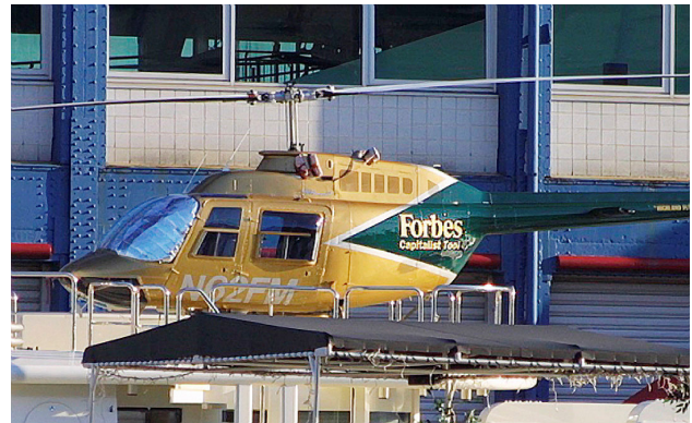
Bell 206B Jetranger Windshield HeatShields