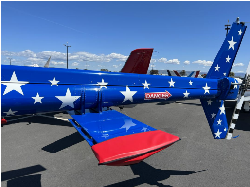
Bell 505 Horizontal Stabilizer Tip Pads

Designed to prevent damage to the aircraft extremities in crowded hangars, these products are made of bright red Naugahyde and thickly padded with a sandwich of closed cell foam.