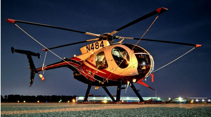
Hughes 500D Blade Tie-Downs

WINTER USE MATERIAL - Made with Solution-Dyed Polyester fabric, this option is intended for seasonal use to aid in deicing, rain mitigation, or for occasional travel. The material is lighter and more compact, but more susceptible to UV damage and may have a shorter useful life if used continuously outside than the all-year use material.