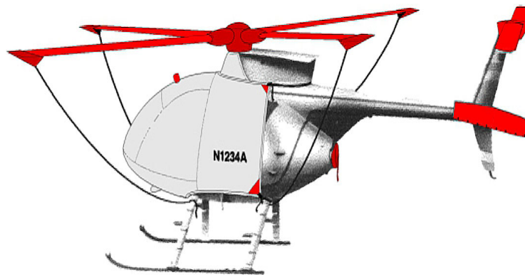
Full Cover Set

The Tailboom Cover details vary by model, but generally the helicopter tail boom cover encloses the tail boom from the "bottleneck" to the aft end. They usually also cover the horizontal stabilizers, and are custom made to allow for antennae, lights, and other protrusions. They attach with straps underneath the tail boom. Covers for the vertical and horizontal stabilizers are also available separately. Specific information for each model is available on request.