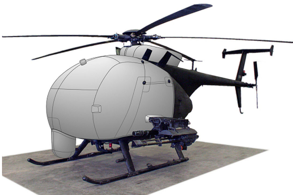
MH-6J Bubble, Flir & Doghouse Covers (illustration)

WINTER USE MATERIAL - Made with Solution-Dyed Polyester fabric, this option is intended for seasonal use to aid in deicing, rain mitigation, or for occasional travel. The material is lighter and more compact, but more susceptible to UV damage and may have a shorter useful life if used continuously outside than the all-year use material.