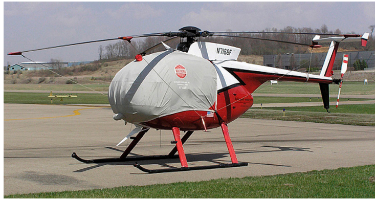
Hughes 500D Bubble Cover with Wire Strike detail and Blade Tie-downs