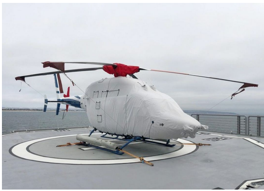
Bell 429 Main Body Cover, Rotor Hub & Tail Rotor Covers