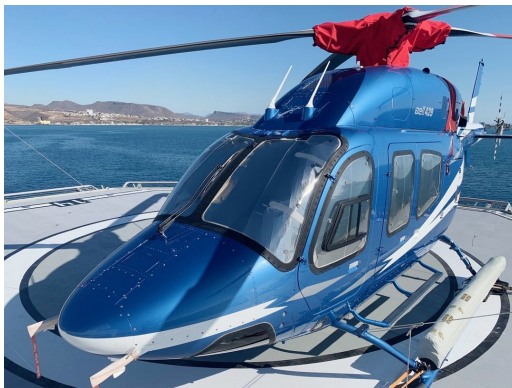
Bell 429 Cockpit & Cabin HeatShields, Rotor Mast/Drive Shafts Cover

Cockpit Heatshields are interior sunshades for the aircraft's cockpit. The product is a unique composite of closed-cell foam with a silver mylar finish. The semi-rigid design is stiff enough to stand inside the window framing. Darts and folds are incorporated into the material so that it conforms to the complex shape of the helicopter windows. The set folds up flat and is easily stored in the included storage sleeve. Some designs may require velcro and suction cups. A Heatshield is an excellent short-term remedy for cockpit overheating, but an external fabric cover is more effective for long-term protection.