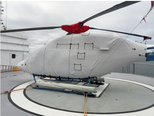
Bell 429 Main Body Cover, Rotor Hub & Tail Rotor Covers

WINTER USE MATERIAL - Made with Solution-Dyed Polyester fabric, this option is intended for seasonal use to aid in deicing, rain mitigation, or for occasional travel. The material is lighter and more compact, but more susceptible to UV damage and may have a shorter useful life if used continuously outside than the all-year use material.