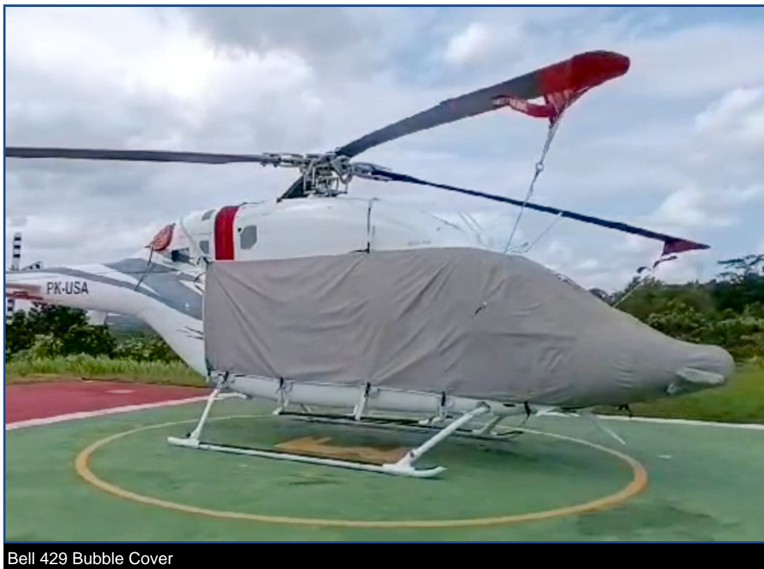
Bell 429 Bubble Cover