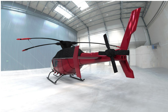
Bell 429 Tail Rotor, Engine, Rotor Hub Covers