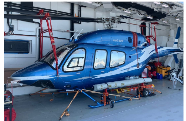
Bell 429 Cockpit & Cabin HeatShields