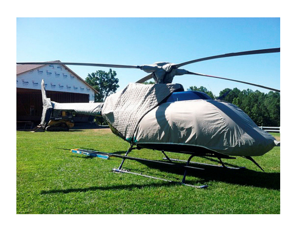
Bell 407 Covers: Bubble, Insulated Engine, Rotor Mast, Blades, Tailboom, Vertical Stabilizer and Tail Rotor