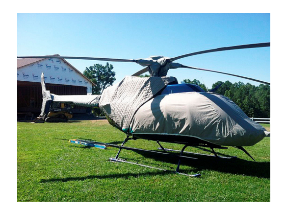
Bell 427 Rotor Blades, Main Rotor Hub/Drive Shafts, Horiz. Stabs, Bell 407 Covers: Bubble, Insulated Engine, Rotor Mast, Blades, Tail Rotor Covers Tailboom, Vertical Stabilizer and Tail Rotor