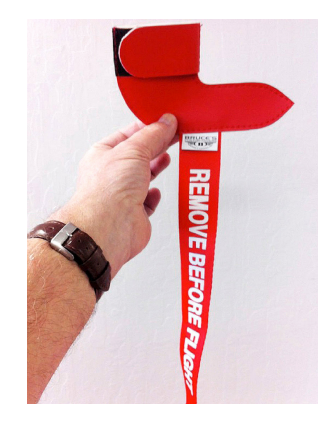
Cessna Conquest I Prop Tie/Exhaust Covers, Engine Plugs