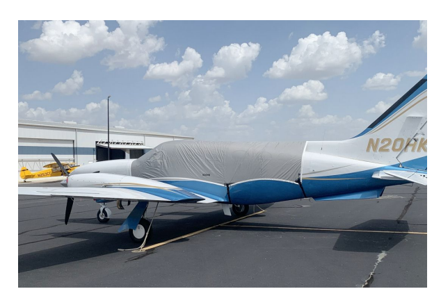
Cessna 414 Travel Weight Canopy Cover