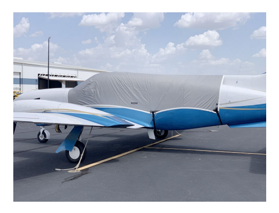
Cessna 414 Travel Weight Canopy Cover

Travel Covers are made with Silver Solution-Dyed Polyester fabric and only lined over the windshield to save weight. The material is lightweight and more compact for easy stowage in the aircraft. The polyester material is water resistant, but only intended for occasional use outside. We also have an ultra lightweight material available for fitted hangar dust covers. For daily outdoor use, the non-travel Sunbrella Cover is the best choice.