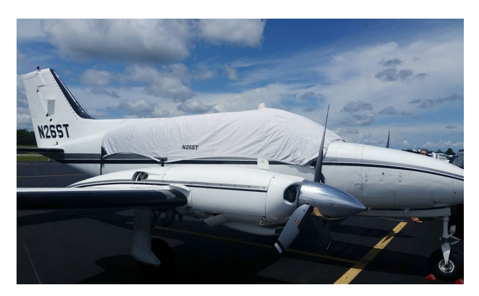
Cessna 414 Canopy Cover