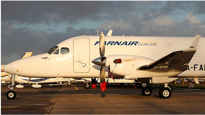
Beech 1900D Prop Tie/Exhaust Cover Sets