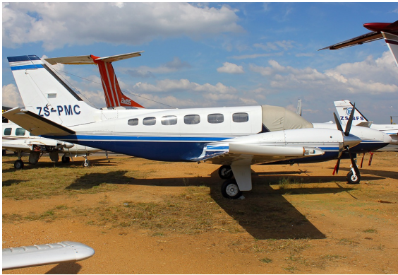
Cessna 441 Conquest II Cockpit Cover