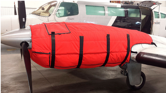
Cessna 404 Insulated Engine Cover