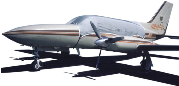
Cessna 421 Cockpit/Windshield Cover

This cover type is made from Silver Acrylic Sunbrella canvas and is 100% lined with a soft and smooth microfiber. Bruce's Custom Covers developed this material combination especially for aircraft protection. The outer material is medium weight and treated for water resistance, UV resistance and anti-static buildup. The inner lining is a very soft and smooth microfiber to prevent scratching. The material is very reflective, and tests show that the cabin interior temperature can be reduced to near-ambient temperature on the hottest of days. It is water, ice and snow repellent, yet breathable to allow moisture to escape from between the cover and the aircraft surface.