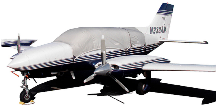
Cessna 414 Canopy Cover & Pitot Covers