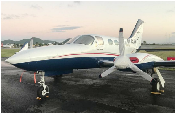
Cessna 414 Propellor/Spinner Covers, 3 Blade

window framing. It folds up flat and easily stores in the included storage sleeve. Some designs may require velcro and suction cups. A Heatshield is an excellent short-term remedy for cockpit overheating.