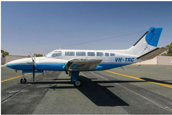
Cessna 404 & F406 HeatShields