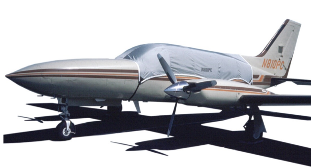
Cessna 421 Cockpit/Windshield Cover

non-travel Sunbrella Cover is the best choice.