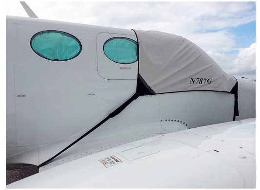
Cessna 340 Cockpit/Windshield Cover