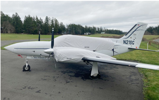
Cessna 421C Canopy & Engine Covers

The Cessna 402 Nose Cover is designed to cover the section of the fuselage forward of the windshield to the tip of the nose. It is secured with belly strapsThis cover type is made from Silver Acrylic Sunbrella canvas and is 100% lined with a soft and smooth microfiber. Bruce's Custom Covers developed this material combination especially for aircraft protection. The outer material is medium weight and treated for water resistance, UV resistance and anti-static buildup. The inner lining is a very soft and smooth microfiber to prevent scratching. The material is very reflective, and tests show that the cabin interior temperature can be reduced to near-ambient temperature on the hottest of days. It is water, ice and snow repellent, yet breathable to allow moisture to escape from between the cover and the aircraft surface.