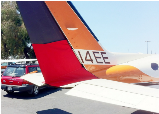
Cessna 414 Rudder Openings Cover (bird barrier)

WINTER USE MATERIAL - Made with Solution-Dyed Polyester fabric, this option is intended for seasonal use to aid in deicing, rain mitigation, or for occasional travel. The material is lighter and more compact, but more susceptible to UV damage and may have a shorter useful life if used continuously outside than the all-year use material.