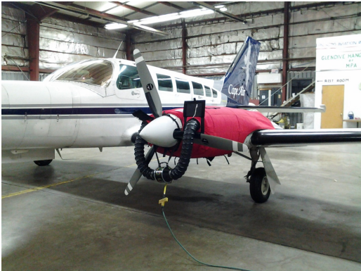
Cessna 402 Insulated Engine Cover with Heater

This cover type is made from Silver Acrylic Sunbrella canvas and is 100% lined with a soft and smooth microfiber. Bruce's Custom Covers developed this material combination especially for aircraft protection. The outer material is medium weight and treated for water resistance, UV resistance and anti-static buildup. The inner lining is a very soft and smooth microfiber to prevent scratching. The material is very reflective, and tests show that the cabin interior temperature can be reduced to near-ambient temperature on the hottest of days. It is water, ice and snow repellent, yet breathable to allow moisture to escape from between the cover and the aircraft surface.