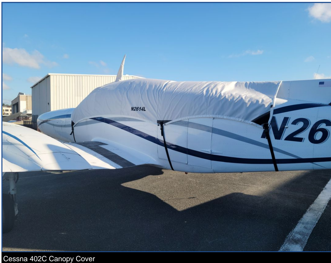
Cessna 402C Canopy Cover