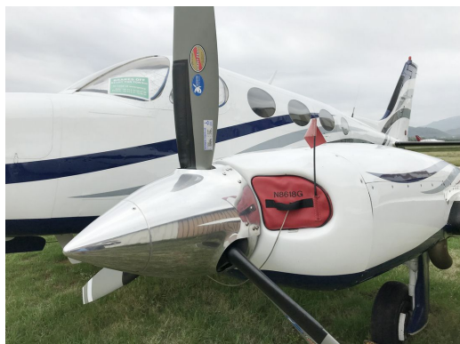
Cessna 340 Engine Inlet Plugs

Engine Inlet Plugs are custom fit for your Cessna 402 intakes, made with heavy-duty vinyl material, and stuffed with a single block of sculpted urethane foam. Each plug has a zipper that allows the foam to be removed and dried if necessary. Engine plugs have warning flags that are visible from the cockpit or 'remove before flight' streamers sewn onto the face of the plugs. Most plugs are imprinted with the aircraft registration number in black for an extra charge. Storage bag NOT included. Engine plugs may be inserted after flight when the engine is still warm. Engine Inlet Plugs are commonly referred to as Cowl Plugs, Intake Plugs, Cowl Blocks, Engine Blocks, and Engine Bungs.