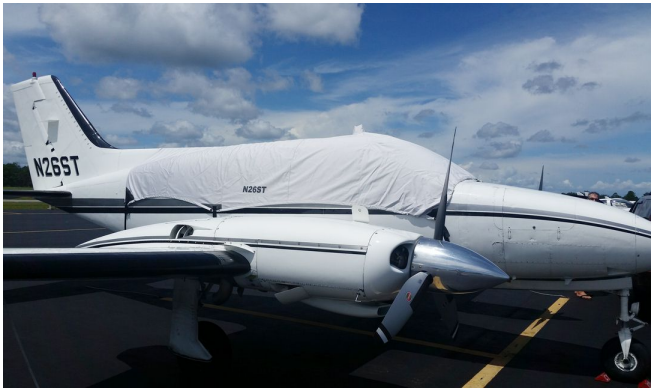
Cessna 414 Canopy Cover