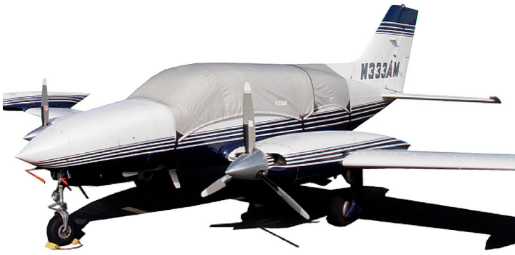
Cessna 414 Canopy Cover & Pitot Covers