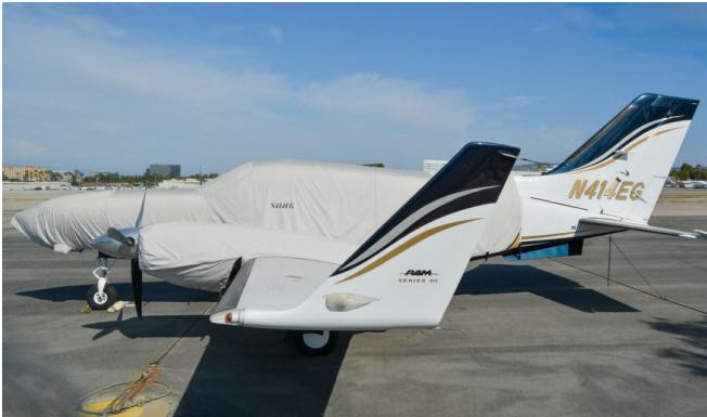
Cessna 414A Extended Canopy/Nose Cover & Engine Covers