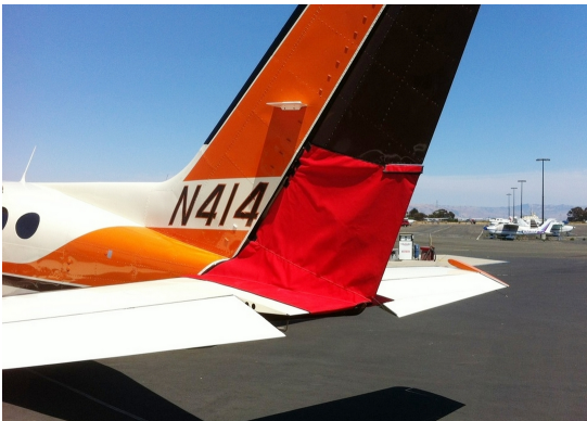
Cessna 414 Rudder Openings Cover (bird barrier)