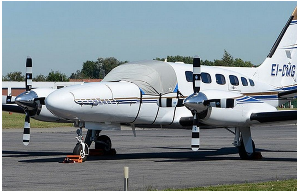
Cessna 441 Cockpit Cover