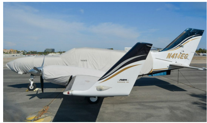
Cessna 414A Extended Canopy/Nose Cover & Engine Covers