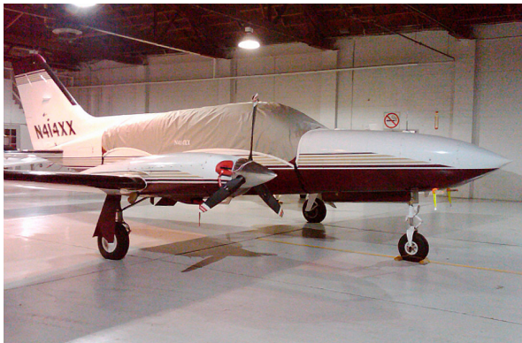
Cessna 414 Canopy Cover and Engine Inlet Plugs

Travel Covers are made with Silver Solution-Dyed Polyester fabric and only lined over the windshield to save weight. The material is lightweight and more compact for easy stowage in the aircraft. The polyester material is water resistant, but only intended for occasional use outside. We also have an ultra lightweight material available for fitted hangar dust covers. For daily outdoor use, the non-travel Sunbrella Cover is the best choice.