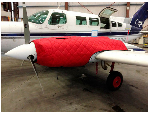
Cessna 402 Insulated Engine Cover