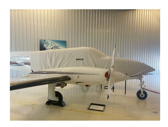
Cessna 340 Extended Canopy/Nose Cover