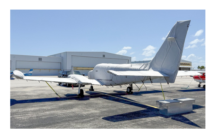
Cessna 340 Complete Cover Set