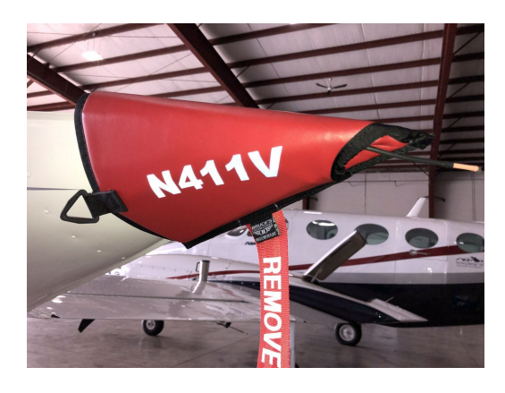
Cessna 335, 340 Wingtip Pads

Designed to prevent damage to the aircraft extremities in crowded hangars, these products are made of bright red Naugahyde and thickly padded with a sandwich of closed cell foam.