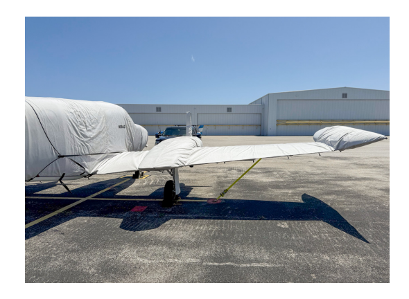
Cessna 340 Complete Cover Set

WINTER USE MATERIAL - Made with Solution-Dyed Polyester fabric, this option is intended for seasonal use to aid in deicing, rain mitigation, or for occasional travel. The material is lighter and more compact, but more susceptible to UV damage and may have a shorter useful life if used continuously outside than the all-year use material.