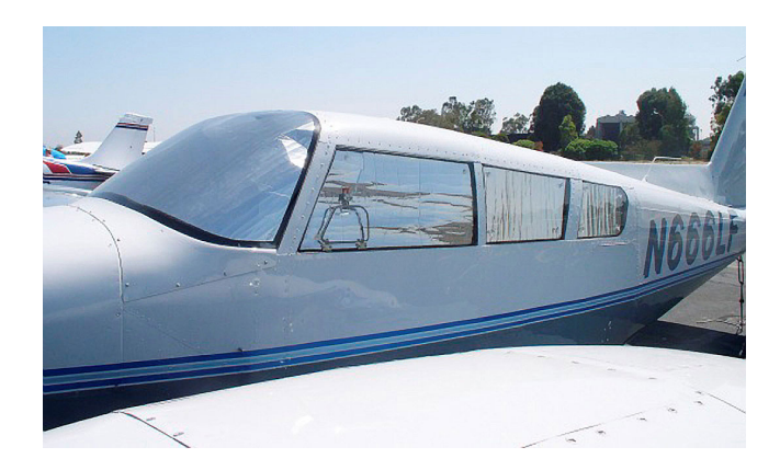
Piper PA-30 Twin Comanche Cockpit HeatShields

Cockpit Heatshields are interior sunshades for the aircraft's cockpit. The product is a unique composite of closed-cell foam with a silver mylar finish. The semi-rigid design is stiff enough to stand inside the window framing. The set folds up flat and is easily stored in the included storage sleeve. Some designs may require velcro and suction cups. A Heatshield is an excellent short-term remedy for cockpit overheating, but an external fabric cover is more effective for long-term protection.