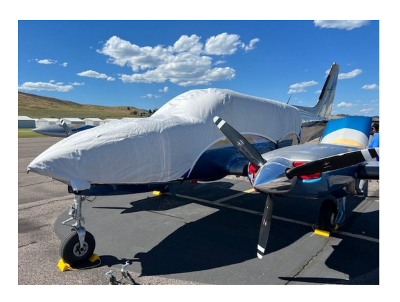
Cessna 340A Canopy/Nose Cover