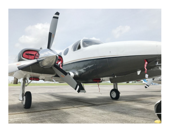
Cessna 340A Engine Plugs