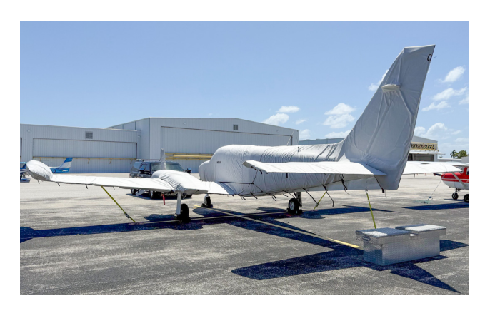
Cessna 340 Complete Cover Set

This cover type is made from Silver Acrylic Sunbrella canvas and is 100% lined with a soft and smooth microfiber. Bruce's Custom Covers developed this material combination especially for aircraft protection. The outer material is medium weight and treated for water resistance, UV resistance and anti-static buildup. The inner lining is a very soft and smooth microfiber to prevent scratching. The material is very reflective, and tests show that the cabin interior temperature can be reduced to near-ambient temperature on the hottest of days. It is water, ice and snow repellent, yet breathable to allow moisture to escape from between the cover and the aircraft surface.