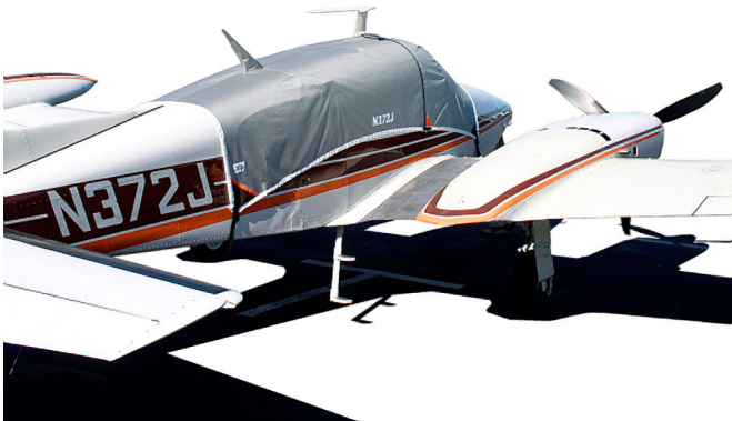
Cessna 320 Canopy Cover

Travel Covers are made with Silver Solution-Dyed Polyester fabric and only lined over the windshield to save weight. The material is lightweight and more compact for easy stowage in the aircraft. The polyester material is water resistant, but only intended for occasional use outside. We also have an ultra lightweight material available for fitted hangar dust covers. For daily outdoor use, the non-travel Sunbrella Cover is the best choice.