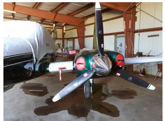
Cessna 310 Engine and Center Section Plugs