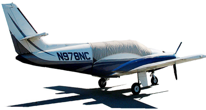
Cessna 303 Crusader Canopy Cover