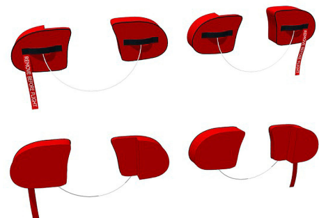
Cessna 414A Engine Plugs