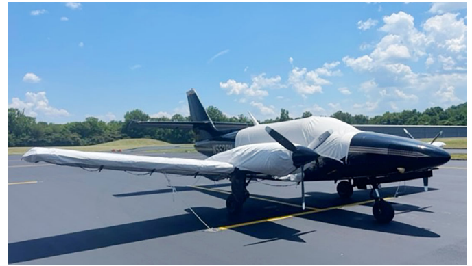
Cessna T303 Crusader Canopy Cover