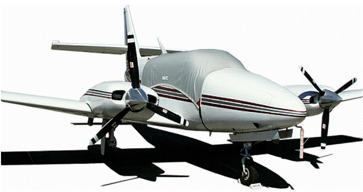
Cessna Crusader Standard Canopy Cover