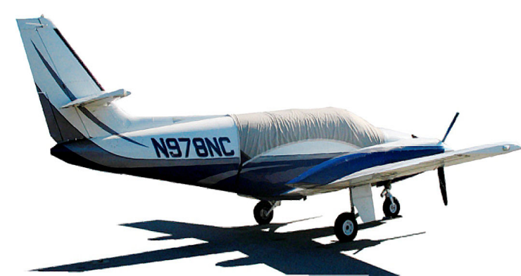
Cessna 303 Crusader Canopy Cover

Travel Covers are made with Silver Solution-Dyed Polyester fabric and only lined over the windshield to save weight. The material is lightweight and more compact for easy stowage in the aircraft. The polyester material is water resistant, but only intended for occasional use outside. We also have an ultra lightweight material available for fitted hangar dust covers. For daily outdoor use, the non-travel Sunbrella Cover is the best choice.