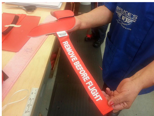
Cessna 150 Pitot Cover

Engine Inlet Plugs are custom fit for your Cessna T303 Crusader intakes, made with heavy-duty vinyl material, and stuffed with a single block of sculpted urethane foam. Each plug has a zipper that allows the foam to be removed and dried if necessary. Engine plugs have warning flags that are visible from the cockpit or 'remove before flight' streamers sewn onto the face of the plugs. Most plugs are imprinted with the aircraft registration number in black for an extra charge. Storage bag NOT included. Engine plugs may be inserted after flight when the engine is still warm. Engine Inlet Plugs are commonly referred to as Cowl Plugs, Intake Plugs, Cowl Blocks, Engine Blocks, and Engine Bungs.