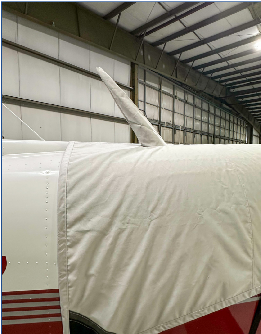
Cessna T303 Canopy Cover