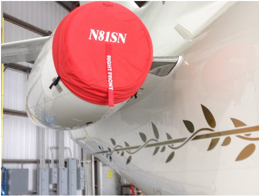
Falcon 900EX Intake Cover

The Falcon Jet 2000EX, 2000LXS Intake Covers are designed to install easily yet be completely storable. A spring steel hoop is sewn into the hem of each cover, allowing them to be installed without climbing onto the wing or using a stepladder. To store the covers the spring steel hoop folds like a band-saw blade into three nesting rings. Each cover folds into a compact circular bundle which is stored in the included duffle bag, yet they unfold quickly for use. The Tri-Fold Ring cover is made of medium weight nylon which is available in a variety of colors to match the paint trim. Each cover set comes complete with installation and folding instructions. The aircraft's registration number can be silkscreened onto the cover for an extra charge.