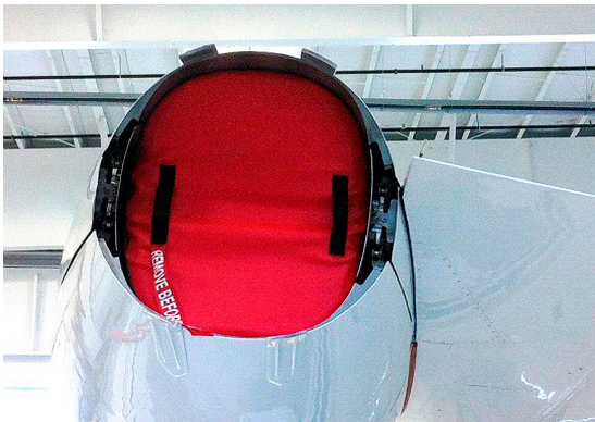
Falcon 2000EX Exhaust Plug

The Engine Inlet Plugs are custom fit for your Falcon Jet 2000EX, 2000LXS intakes, made with heavy-duty vinyl material, and stuffed with a single block of sculpted urethane foam. Each plug has a zipper that allows the foam to be removed and dried if necessary. Engine plugs have 'remove before flight' streamers sewn onto the face of the plugs. Most plugs are imprinted with the aircraft registration number in black for an extra charge. Storage bag NOT included. Engine plugs may be inserted after flight when the engine is still warm. Engine Inlet Plugs are commonly referred to as Cowl Plugs, Intake Plugs, Cowl Blocks, Engine Blocks, and Engine Bungs.