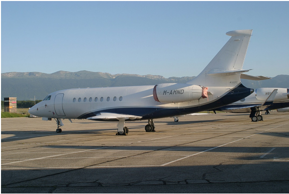
Falcon 2000EX Engine Covers, OEM type