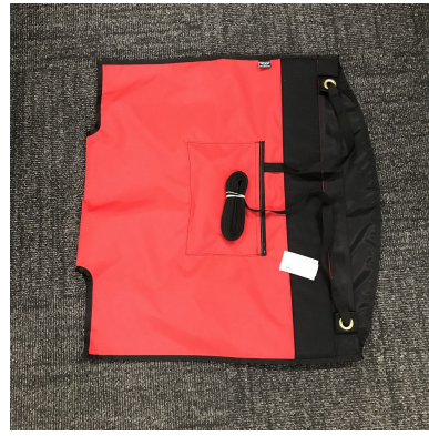
Bell 230 Blade Tie-Downs, (Semi-Rigid) W/Telescoping Attachment Handle