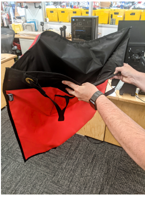
Semi-rigid for easy installation.