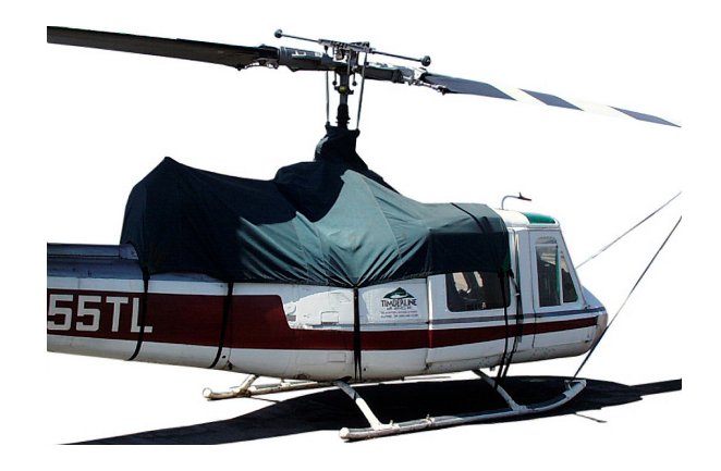
Forward Cabin Nose & Mid-Cabin/Engine Cover (extended to cross tubes)