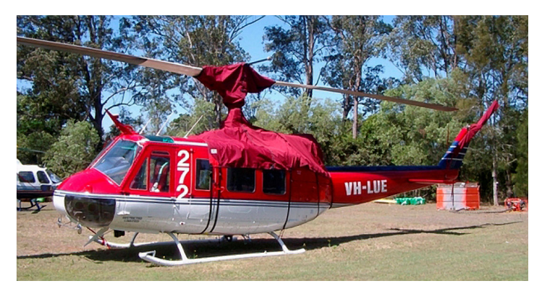
Bell 204/205 Engine/Mid-Cabin Cover, Main & Tail Rotor Covers