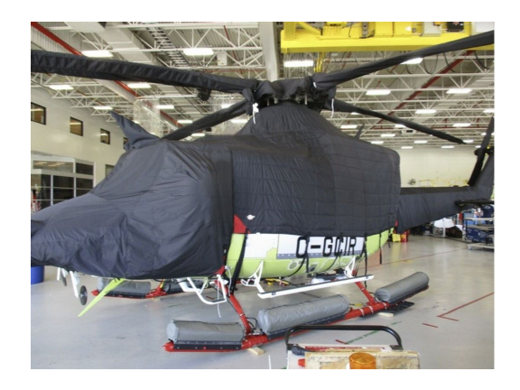
Bell 412 Cockpit/Canopy/Nose, Insulated Engine Area, Rotor Hub, Blade, Tailboom and Tail Rotor Coversroto