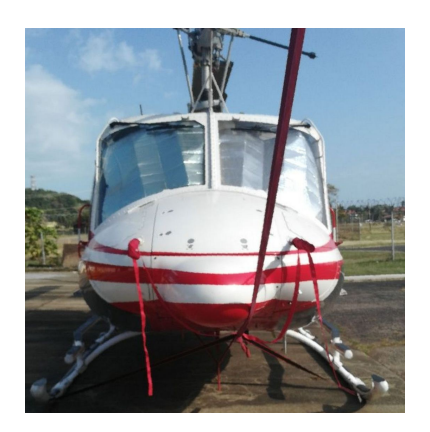
Bell 212 Windshield HeatShields

Cockpit Heatshields are interior sunshades for the aircraft's cockpit. The product is a unique composite of closed-cell foam with a silver mylar finish. The semi-rigid design is stiff enough to stand inside the window framing. Darts and folds are incorporated into the material so that it conforms to the complex shape of the helicopter windows. The set folds up flat and is easily stored in the included storage sleeve. Some designs may require velcro and suction cups. A Heatshield is an excellent short-term remedy for cockpit overheating, but an external fabric cover is more effective for long-term protection.