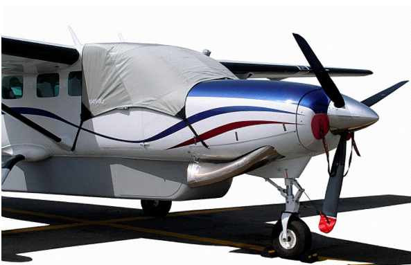
Cessna Caravan Windshield Cover, Plugs, Prop Ties & Pitot Cover