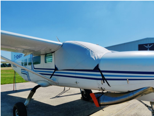
Cessna Caravan 208A Cockpit Cover