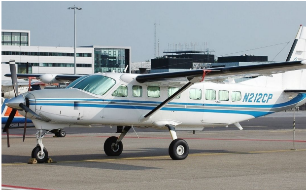
Cessna 208 Caravan, U-27A, AC-208 Heatshield Set (208a Models)