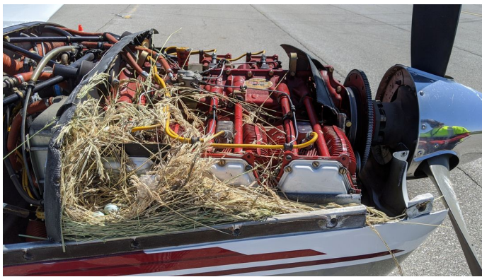
ENGINE PLUGS PREVENT BIRD NEST FOD. Piper Saratoga Engine Cessna Caravan Windshield HeatShield, Plugs, Prop Ties & Pitot Cover Cowling Bird's Nest