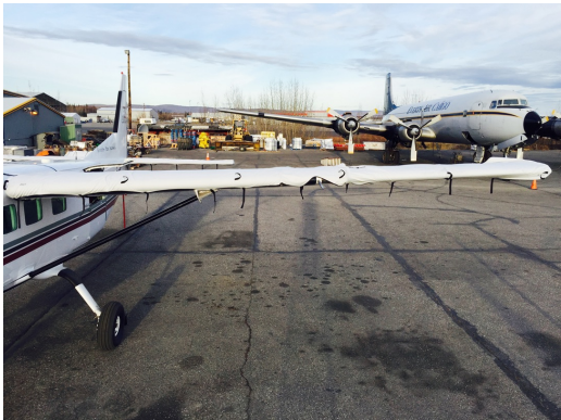
Cessna 208 Caravan Wing & Horiz. Stab Covers

WINTER USE MATERIAL - Made with Solution-Dyed Polyester fabric, this option is intended for seasonal use to aid in deicing, rain mitigation, or for occasional travel. The material is lighter and more compact, but more susceptible to UV damage and may have a shorter useful life if used continuously outside than the all-year use material.