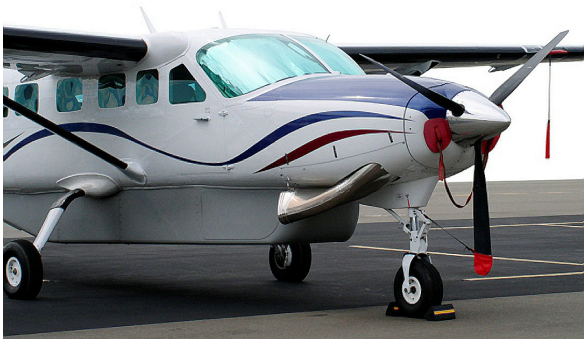
Cessna Caravan Windshield HeatShield, Plugs, Prop Ties & Pitot Cover

Heatshields are interior sunshades for an aircraft's windows or canopy glass. The product is a unique composite of closed-cell foam with a silver mylar finish. The semi-rigid design is stiff enough to stand along the inside of the windshield using sun visors or window framing. It folds up flat and easily stores in the included storage sleeve. Some designs may require velcro and suction cups. A Heatshield is an excellent short-term remedy for cockpit overheating.