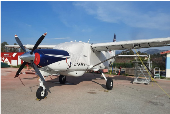
Cessna 208 Caravan Wrap-Around Canopy Cover, Wing Covers