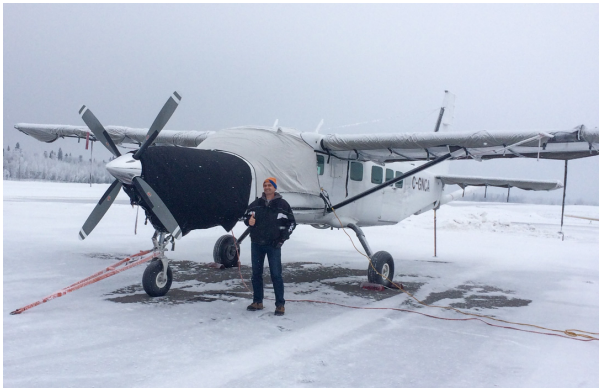
Cessna 208 Caravan Insulated Engine Cover, fully enclosed