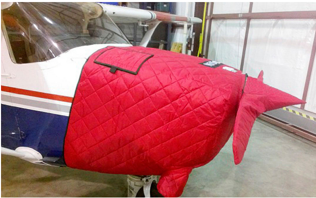
Cessna 172 Insulated Engine Cover w/ Oil Filler Door flap and Insulated Prop/Spinner Cover

This cover type is made from Silver Acrylic Sunbrella canvas and is 100% lined with a soft and smooth microfiber. Bruce's Custom Covers developed this material combination especially for aircraft protection. The outer material is medium weight and treated for water resistance, UV resistance and anti-static buildup. The inner lining is a very soft and smooth microfiber to prevent scratching. The material is very reflective, and tests show that the cabin interior temperature can be reduced to near-ambient temperature on the hottest of days. It is water, ice and snow repellent, yet breathable to allow moisture to escape from between the cover and the aircraft surface.