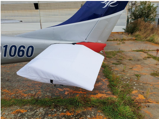
Cessna 207 Tailcone Cover, Horizontal Stab. Cover (test fit)