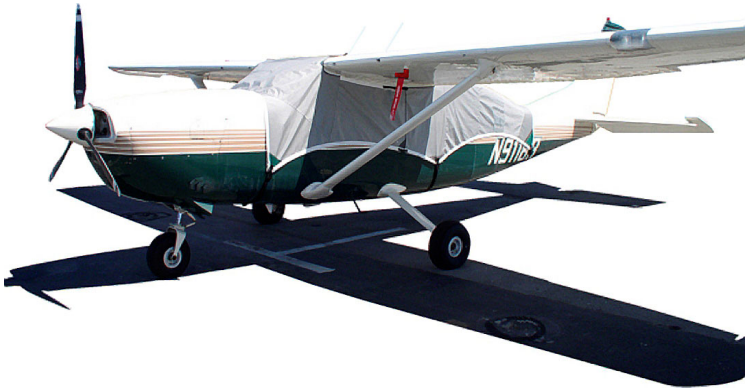
Cessna 207 Canopy Cover