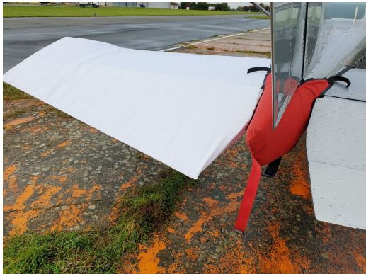
Cessna 207 Tailcone Cover, Horizontal Stab. Cover (test fit)

WINTER USE MATERIAL - Made with Solution-Dyed Polyester fabric, this option is intended for seasonal use to aid in deicing, rain mitigation, or for occasional travel. The material is lighter and more compact, but more susceptible to UV damage and may have a shorter useful life if used continuously outside than the all-year use material.