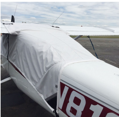
Cessna 205 Over-Top Canopy Cover

Travel Covers are made with Silver Solution-Dyed Polyester fabric and only lined over the windshield to save weight. The material is lightweight and more compact for easy stowage in the aircraft. The polyester material is water resistant, but only intended for occasional use outside. We also have an ultra lightweight material available for fitted hangar dust covers. For daily outdoor use, the non-travel Sunbrella Cover is the best choice.