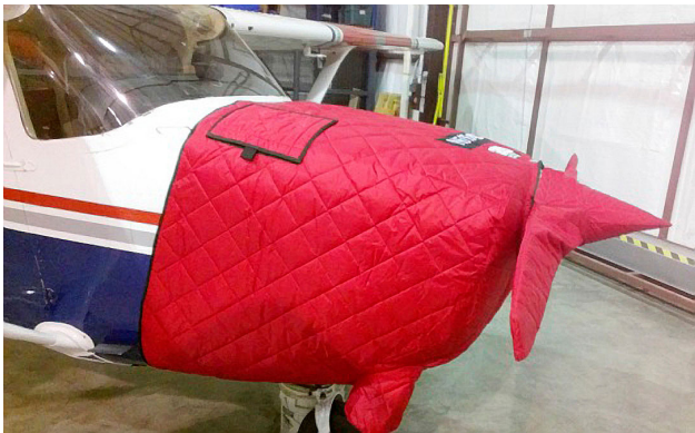
Cessna 172 Insulated Engine Cover w/ Oil Filler Door flap and Insulated Prop/Spinner Cover