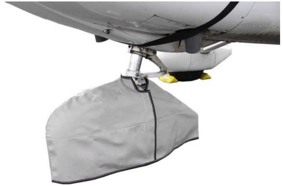
Cessna 172 Nose Gear Fairing Cover