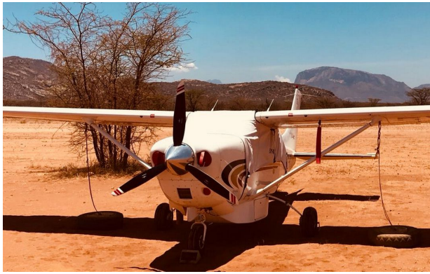
Cessna 206 Canopy Cover