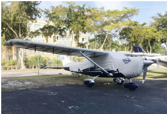
Cessna T206H Canopy, Engine, Wing & Empennage Covers

This cover type is made from Silver Acrylic Sunbrella canvas and is 100% lined with a soft and smooth microfiber. Bruce's Custom Covers developed this material combination especially for aircraft protection. The outer material is medium weight and treated for water resistance, UV resistance and anti-static buildup. The inner lining is a very soft and smooth microfiber to prevent scratching. The material is very reflective, and tests show that the cabin interior temperature can be reduced to near-ambient temperature on the hottest of days. It is water, ice and snow repellent, yet breathable to allow moisture to escape from between the cover and the aircraft surface.