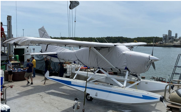
Cessna U206F Amphib Cover Set

WINTER USE MATERIAL - Made with Solution-Dyed Polyester fabric, this option is intended for seasonal use to aid in deicing, rain mitigation, or for occasional travel. The material is lighter and more compact, but more susceptible to UV damage and may have a shorter useful life if used continuously outside than the all-year use material.