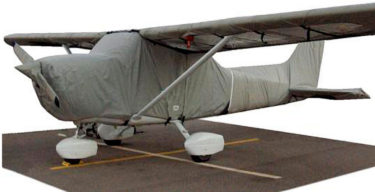
Cessna 172 Propellor Cover, 2 Blade