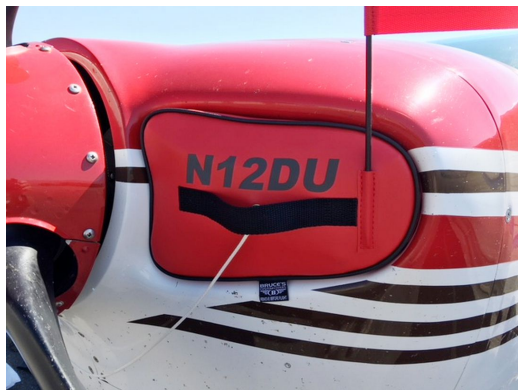
Cessna TU206G Engine Plugs

plugs are imprinted with the aircraft registration number in black for an extra charge. Storage bag NOT included. Engine plugs may be inserted after flight when the engine is still warm. Engine Inlet Plugs are commonly referred to as Cowl Plugs, Intake Plugs, Cowl Blocks, Engine Blocks, and Engine Bungs.