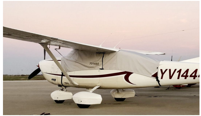
Cessna 206 Canopy Cover