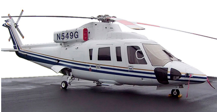
Snap-On Cockpit Cover

This cover type is made from Silver Acrylic Sunbrella canvas and is 100% lined with a soft and smooth microfiber. Bruce's Custom Covers developed this material combination especially for aircraft protection. The outer material is medium weight and treated for water resistance, UV resistance and anti-static buildup. The inner lining is a very soft and smooth microfiber to prevent scratching. The material is very reflective, and tests show that the cabin interior temperature can be reduced to near-ambient temperature on the hottest of days. It is water, ice and snow repellent, yet breathable to allow moisture to escape from between the cover and the aircraft surface.