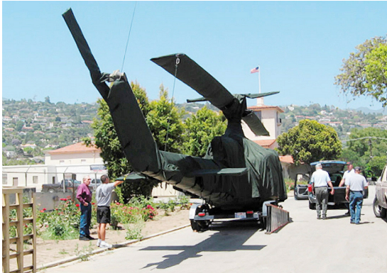
Bell 204/205 Full Body Cover Set