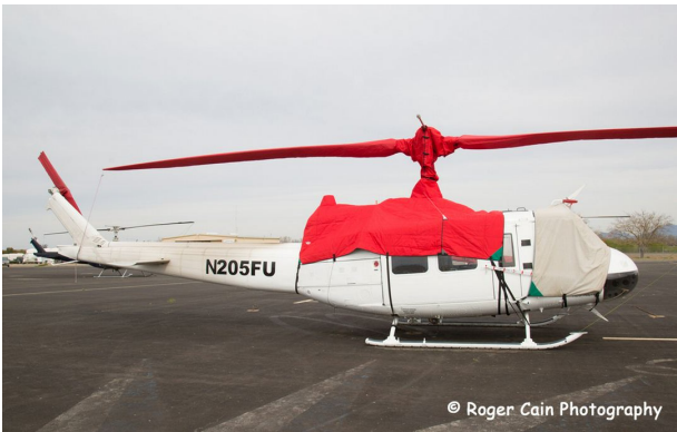
Bell 205 Engine, Rotor Mast, Blades & Forward Cabin Covers

WINTER USE MATERIAL - Made with Solution-Dyed Polyester fabric, this option is intended for seasonal use to aid in deicing, rain mitigation, or for occasional travel. The material is lighter and more compact, but more susceptible to UV damage and may have a shorter useful life if used continuously outside than the all-year use material.