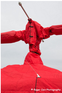
Bell 205 Engine, Rotor Mast & Blades Covers