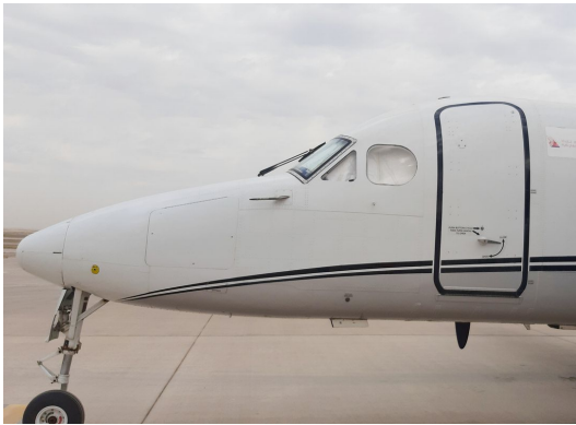
Raytheon 1900D Cockpit HeatShields

Cockpit Heatshields are interior sunshades for the aircraft's cockpit. The product is a unique composite of closed-cell foam with a silver mylar finish. The semi-rigid design is stiff enough to stand inside the window framing. The set folds up flat and is easily stored in the included storage sleeve. Some designs may require velcro and suction cups. A Heatshield is an excellent short-term remedy for cockpit overheating, but an external fabric cover is more effective for long-term protection.