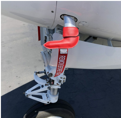
Beech King Air Pitot Covers

Engine Inlet Plugs are custom fit for your Beech 1900C intakes, made with heavy-duty vinyl material, and stuffed with a single block of sculpted urethane foam. Each plug has a zipper that allows the foam to be removed and dried if necessary. Engine plugs have warning flags that are visible from the cockpit or 'remove before flight' streamers sewn onto the face of the plugs. Most plugs are imprinted with the aircraft registration number in black for an extra charge. Storage bag NOT included. Engine plugs may be inserted after flight when the engine is still warm. Engine Inlet Plugs are commonly referred to as Cowl Plugs, Intake Plugs, Cowl Blocks, Engine Blocks, and Engine Bung. s.