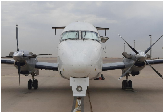
Raytheon 1900D Cockpit HeatShields