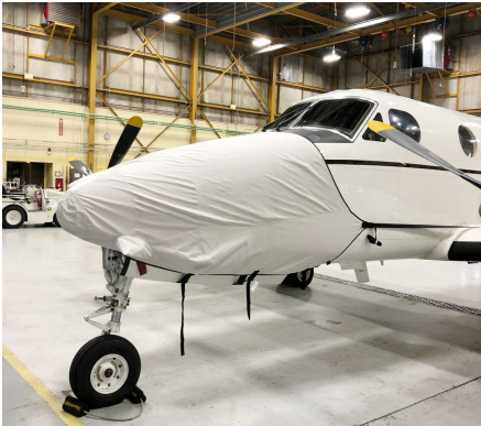
King Air 200 Nose Cover