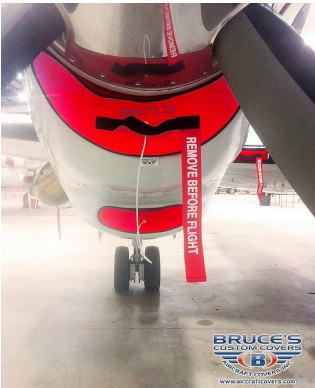
Engine and Oil Cooler Inlet Plugs