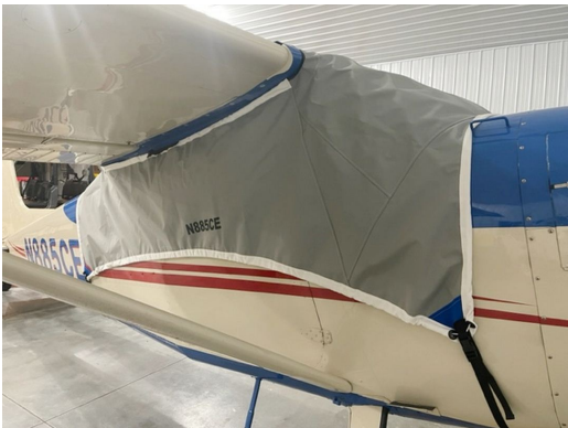
Cessna 180 Travel Weight Canopy Cover