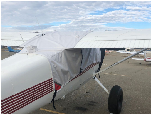
Cessna 180/185 Skywagon Canopy Cover, Over-Top Style

This cover type is made from Silver Acrylic Sunbrella canvas and is 100% lined with a soft and smooth microfiber. Bruce's Custom Covers developed this material combination especially for aircraft protection. The outer material is medium weight and treated for water resistance, UV resistance and anti-static buildup. The inner lining is a very soft and smooth microfiber to prevent scratching. The material is very reflective, white, and tests show that the cabin interior temperature can be reduced to near-ambient temperature on the hottest of days. It is water, ice and snow repellent, yet breathable to allow moisture to escape from between the cover and the aircraft surface.