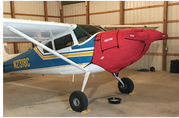
Cessna 180 Insulated Engine Cover