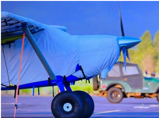
Cessna 185 Canopy, Wing & Engine Covers

WINTER USE MATERIAL - Made with Solution-Dyed Polyester fabric, this option is intended for seasonal use to aid in deicing, rain mitigation, or for occasional travel. The material is lighter and more compact, but more susceptible to UV damage and may have a shorter useful life if used continuously outside than the all-year use material.