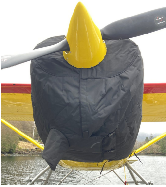
Cessna 180H Insulated Engine Cover