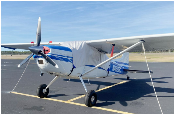
Cessna A185F Over-Top Canopy Cover, Engine Plugs.