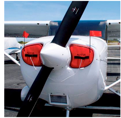
Cessna 172 Engine Plugs