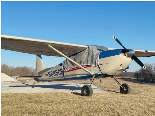
Cessna 180 Travel Weight Canopy Cover

The material is very reflective, and tests show that the cabin interior temperature can be reduced to near-ambient temperature on the hottest of days. It is water, ice and snow repellent, yet breathable to allow moisture to escape from between the cover and the aircraft surface.