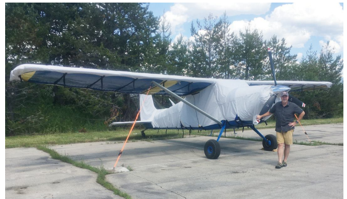
Cessna 180 Complete Hail Protection Cover Set