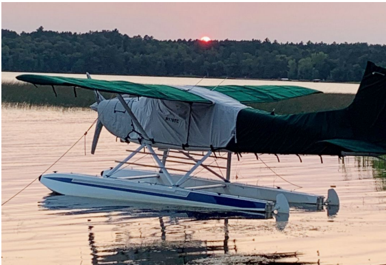
Cessna A185F Complete Cover Set