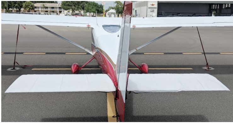
Cessna 162 Skycatcher Horizontal Stabilizer Covers