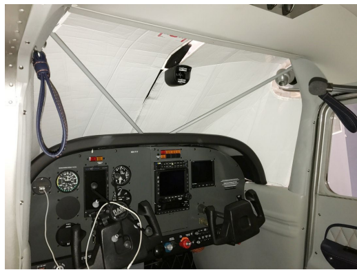
Cessna 180 Skywagon Windshield Heatshield, (W/ Compass)