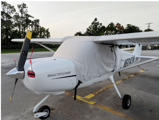
Cessna Skycatcher 162 Engine Inlet Plugs Cessna Skycatcher 162 Canopy Cover and Engine Inlet Plugs