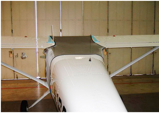
Cessna Skycatcher Canopy Cover