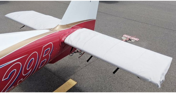
Cessna 162 Skycatcher Horizontal Stabilizer Covers