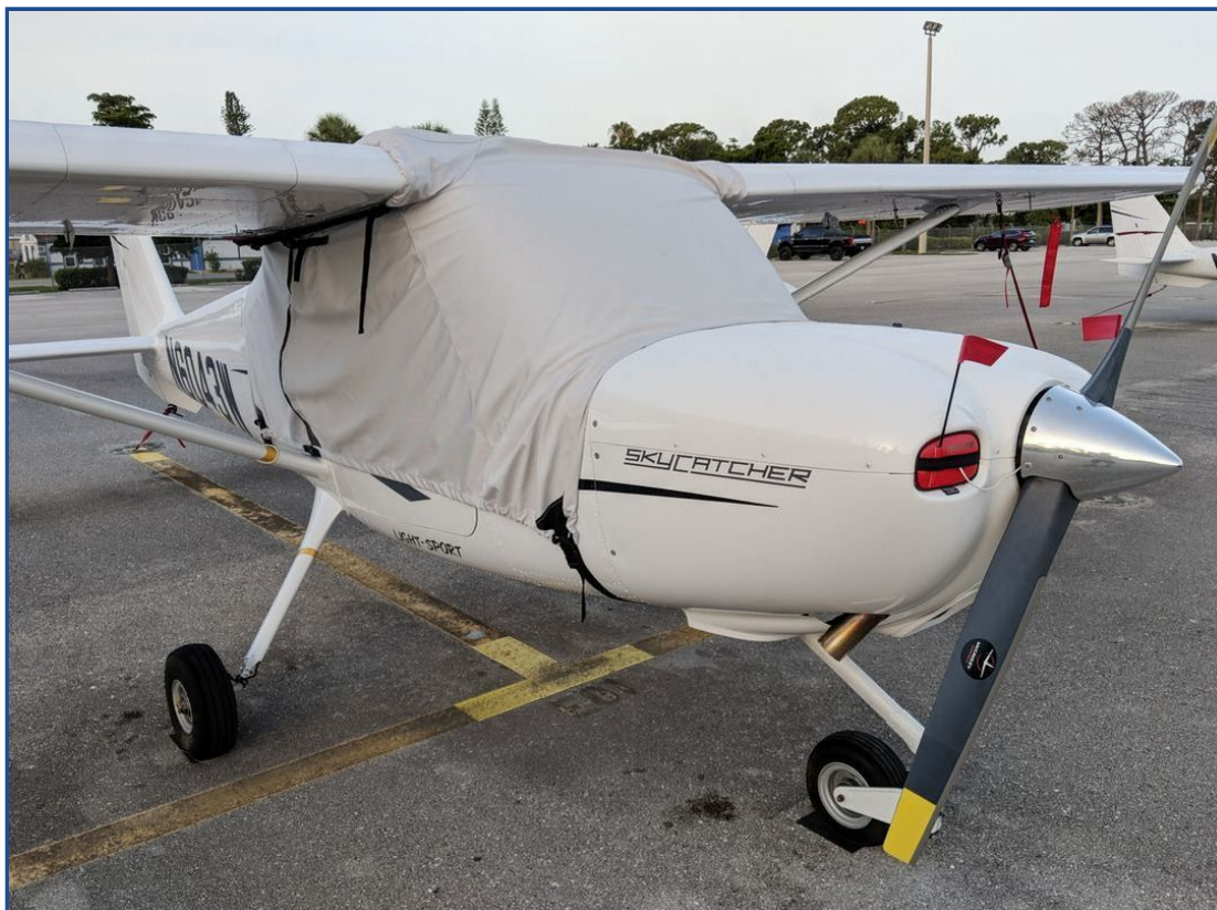
Cessna Skycatcher 162 Canopy Cover and Engine Inlet Plugs