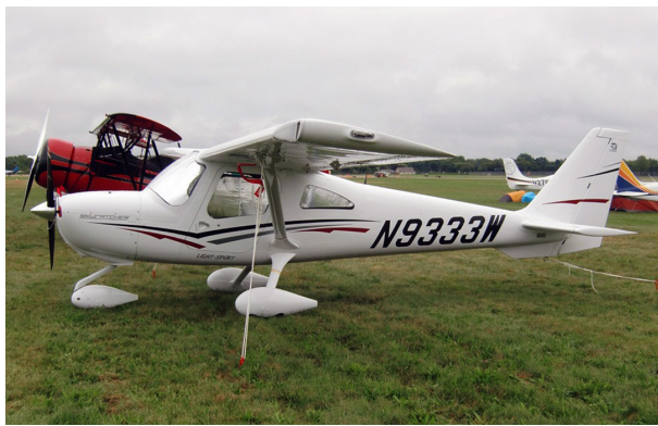
Cessna Skycatcher 162 Heatshield Set