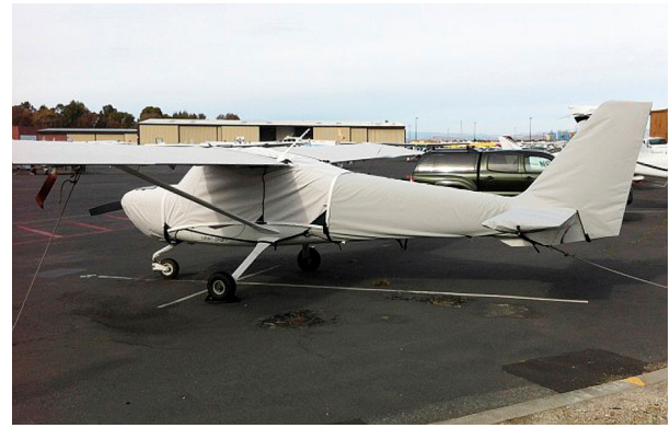
Cessna Skycatcher Full Cover Set