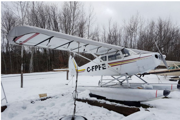
Christavia Mk 1 Wing Covers