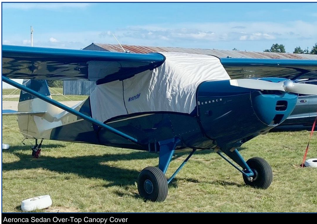
Aeronca Sedan Over-Top Canopy Cover