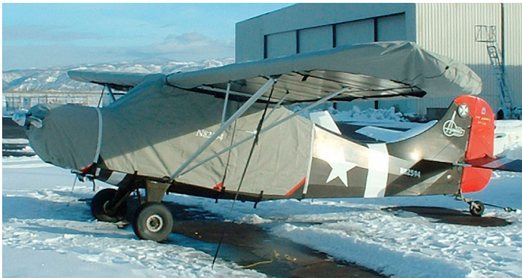
Extended Canopy Cover, Engine & Wing Covers