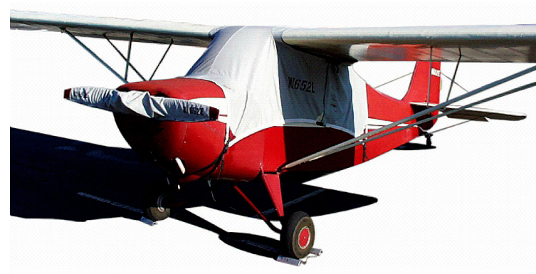
Aeronca Champ Canopy & Prop Covers

This cover type is made from Silver Acrylic Sunbrella canvas and is 100% lined with a soft and smooth microfiber. Bruce's Custom Covers developed this material combination especially for aircraft protection. The outer material is medium weight and treated for water resistance, UV resistance and anti-static buildup. The inner lining is a very soft and smooth microfiber to prevent scratching. The material is very reflective, and tests show that the cabin interior temperature can be reduced to near-ambient temperature on the hottest of days. It is water, ice and snow repellent, yet breathable to allow moisture to escape from between the cover and the aircraft surface.