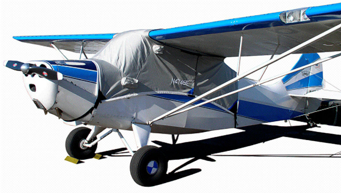
Aeronca Champ Canopy Cover

This cover type is made from Silver Acrylic Sunbrella canvas and is 100% lined with a soft and smooth microfiber. Bruce's Custom Covers developed this material combination especially for aircraft protection. The outer material is medium weight and treated for water resistance, UV resistance and anti-static buildup. The inner lining is a very soft and smooth microfiber to prevent scratching. The material is very reflective, and tests show that the cabin interior temperature can be reduced to near-ambient temperature on the hottest of days. It is water, ice and snow repellent, yet breathable to allow moisture to escape from between the cover and the aircraft surface.