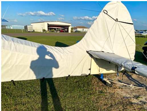
Aeronca Sedan Empennage Cover (Tailboom, Vertical & Horiz Stabilizers), All Year Use

WINTER USE MATERIAL - Made with Solution-Dyed Polyester fabric, this option is intended for seasonal use to aid in deicing, rain mitigation, or for occasional travel. The material is lighter and more compact, but more susceptible to UV damage and may have a shorter useful life if used continuously outside than the all-year use material.