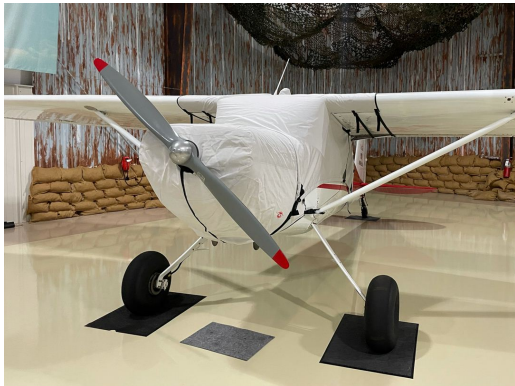
Cessna 140 Canopy Cover, Over Top Type, (140a Models, Covers Gas Caps)

This cover type is made from Silver Acrylic Sunbrella canvas and is 100% lined with a soft and smooth microfiber. Bruce's Custom Covers developed this material combination especially for aircraft protection. The outer material is medium weight and treated for water resistance, UV resistance and anti-static buildup. The inner lining is a very soft and smooth microfiber to prevent scratching. The material is very reflective, and tests show that the cabin interior temperature can be reduced to near-ambient temperature on the hottest of days. It is water, ice and snow repellent, yet breathable to allow moisture to escape from between the cover and the aircraft surface.