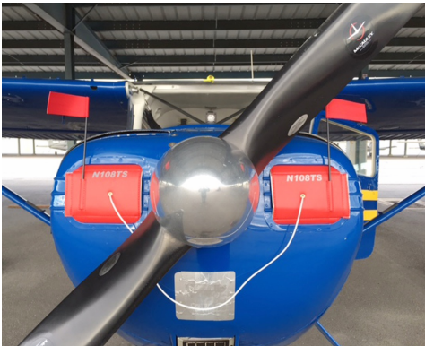
Cessna 170 Engine Inlet Covers (cards)