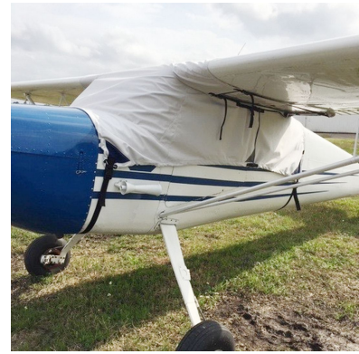
Cessna 140 Over-Top Canopy Cover