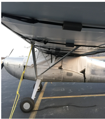
Cessna 140 Canopy Cover, Wing Covers