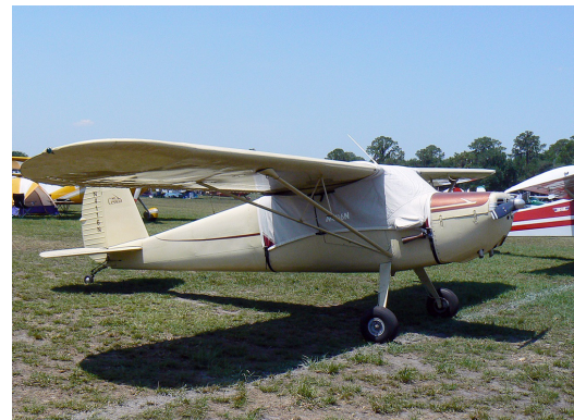
Cessna 140 Over-Top Canopy Cover