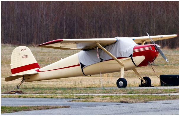
Cessna 140 Canopy Cover