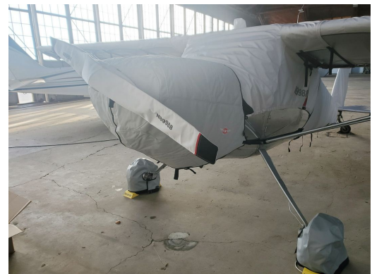
Cessna 140 Canopy, Wings, Prop, Tires & Empennage Covers Cessna 140 Canopy, Wings, Prop, Tires & Empennage Covers