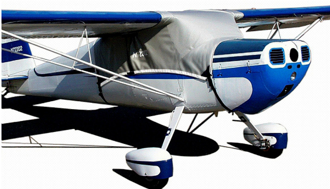
Cessna 120 Over-Top Canopy Cover

This cover type is made from Silver Acrylic Sunbrella canvas and is 100% lined with a soft and smooth microfiber. Bruce's Custom Covers developed this material combination especially for aircraft protection. The outer material is medium weight and treated for water resistance, UV resistance and anti-static buildup. The inner lining is a very soft and smooth microfiber to prevent scratching. The material is very reflective, and tests show that the cabin interior temperature can be reduced to near-ambient temperature on the hottest of days. It is water, ice and snow repellent, yet breathable to allow moisture to escape from between the cover and the aircraft surface.