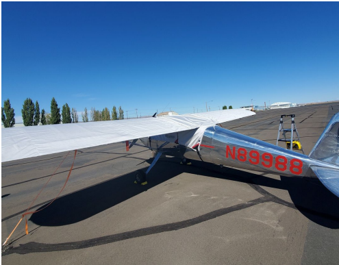
Cessna 140 Wing Covers

WINTER USE MATERIAL - Made with Solution-Dyed Polyester fabric, this option is intended for seasonal use to aid in deicing, rain mitigation, or for occasional travel. The material is lighter and more compact, but more susceptible to UV damage and may have a shorter useful life if used continuously outside than the all-year use material.