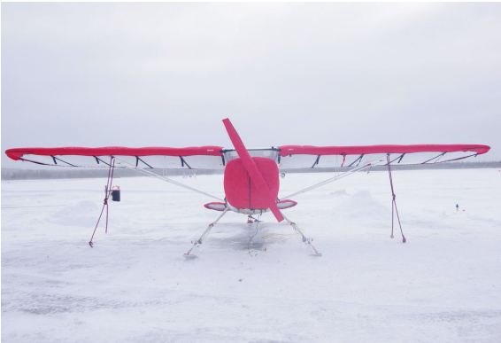
Cessna 120 Insulated Engine & Prop Covers, Wing & Tail Covers