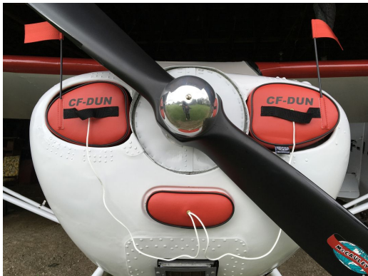
Aeronca 11AC Engine Inlet Plugs