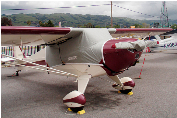
Taylorcraft Over-Top Canopy Cover