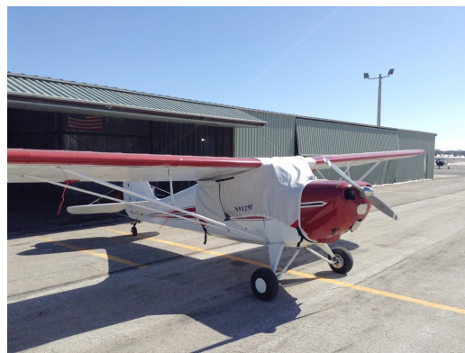
Aeronca Chief Canopy Cover