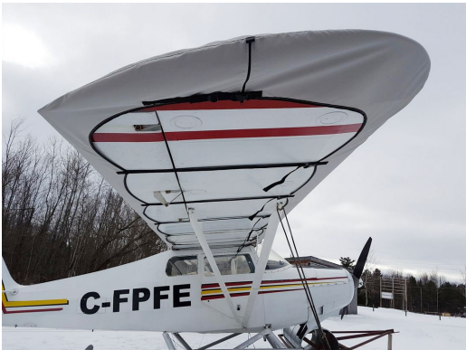
Christavia Mk 1 Wing Covers