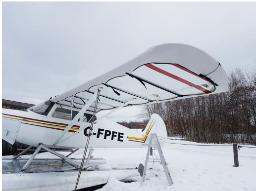
Christavia Mk 1 Wing Covers

WINTER USE MATERIAL - Made with Solution-Dyed Polyester fabric, this option is intended for seasonal use to aid in deicing, rain mitigation, or for occasional travel. The material is lighter and more compact, but more susceptible to UV damage and may have a shorter useful life if used continuously outside than the all-year use material.