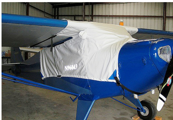
Taylorcraft BC12-D Over-the-top Canopy Cover

This cover type is made from Silver Acrylic Sunbrella canvas and is 100% lined with a soft and smooth microfiber. Bruce's Custom Covers developed this material combination especially for aircraft protection. The outer material is medium weight and treated for water resistance, UV resistance and anti-static buildup. The inner lining is a very soft and smooth microfiber to prevent scratching. The material is very reflective, and tests show that the cabin interior temperature can be reduced to near-ambient temperature on the hottest of days. It is water, ice and snow repellent, yet breathable to allow moisture to escape from between the cover and the aircraft surface.