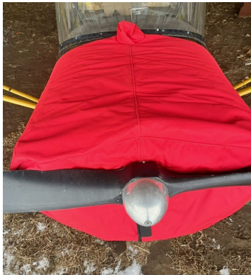
Aeronca 11AC Chief Insulated Engine Cover

This cover type is made from Silver Acrylic Sunbrella canvas and is 100% lined with a soft and smooth microfiber. Bruce's Custom Covers developed this material combination especially for aircraft protection. The outer material is medium weight and treated for water resistance, UV resistance and anti-static buildup. The inner lining is a very soft and smooth microfiber to prevent scratching. The material is very reflective, and tests show that the cabin interior temperature can be reduced to near-ambient temperature on the hottest of days. It is water, ice and snow repellent, yet breathable to allow moisture to escape from between the cover and the aircraft surface.