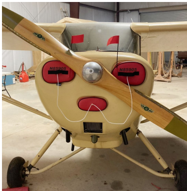
Aeronca 11AC Engine Inlet Plugs

Engine Inlet Plugs are custom fit for your Aeronca Chief 11AC, Super Chief 11CC intakes, made with heavy-duty vinyl material, and stuffed with a single block of sculpted urethane foam. Each plug has a zipper that allows the foam to be removed and dried if necessary. Engine plugs have warning flags that are visible from the cockpit or 'remove before flight' streamers sewn onto the face of the plugs. Most plugs are imprinted with the aircraft registration number in black for an extra charge. Storage bag NOT included. Engine plugs may be inserted after flight when the engine is still warm. Engine Inlet Plugs are commonly referred to as Cowl Plugs, Intake Plugs, Cowl Blocks, Engine Blocks, and Engine Bungs.