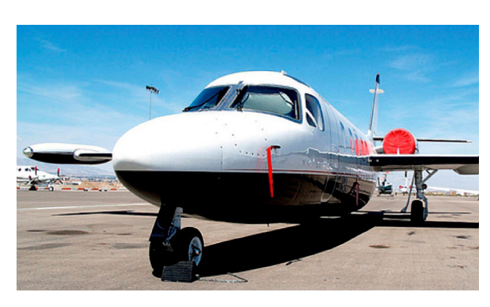
Westwind Engine Cover Set, Pitot Cover