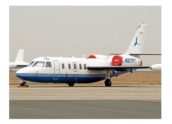
Engine Covers & Cockpit HeatShields

The Israel Aircraft Westwind 1123 Bikini Style Engine Covers are a single-piece design using a soft and smooth stretchy and fabric. The cover stretches tightly over both the intake and exhaust, installing quickly and easily. These covers are designed to be used as hangar dust covers and have a useful life of approximately one year.