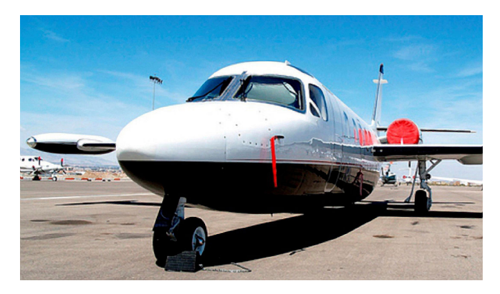
Westwind Engine Cover Set, Pitot Cover

The Engine Inlet Plugs are custom fit for your Israel Aircraft Industries Jet Commander 1121 intakes, made with heavy-duty vinyl material, and stuffed with a single block of sculpted urethane foam. Each plug has a zipper that allows the foam to be removed and dried if necessary. Engine plugs have 'remove before flight' streamers sewn onto the face of the plugs. Most plugs are imprinted with the aircraft registration number in black for an extra charge. Storage bag NOT included. Engine plugs may be inserted after flight when the engine is still warm. Engine Inlet Plugs are commonly referred to as Cowl Plugs, Intake Plugs, Cowl Blocks, Engine Blocks, and Engine Bungs.