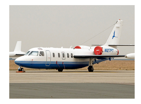
Engine Covers & Cockpit HeatShields