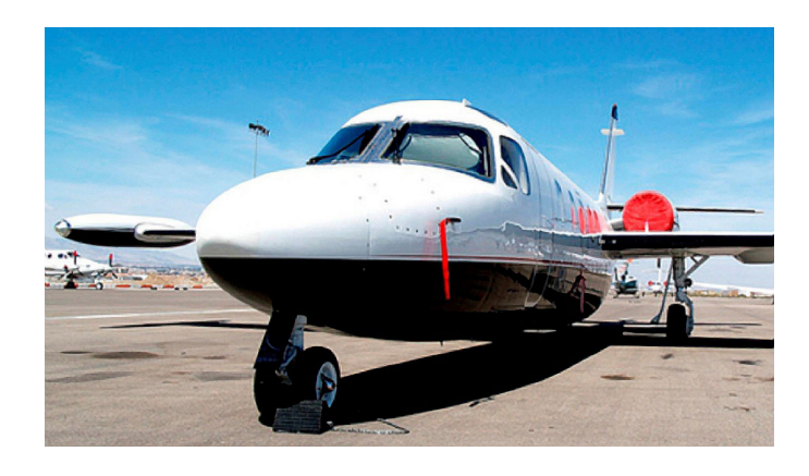
Westwind Engine Cover Set, Pitot Cover

The Israel Aircraft Industries Jet Commander 1121 Bikini Style Engine Covers are a single-piece design using a soft and smooth stretchy and fabric. The cover stretches tightly over both the intake and exhaust, installing quickly and easily. These covers are designed to be used as hangar dust covers and have a useful life of approximately one year.